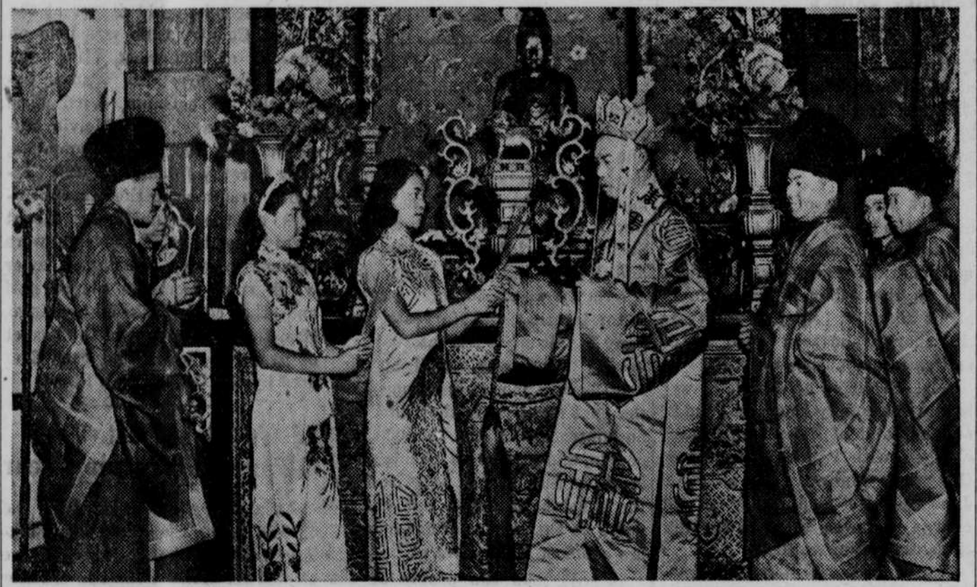
Buddhist rites, devil dancers and the traditional cavorting Chinese lion featured pageantry in Los Angeles' new China city recently when that picturesque quarter was cleaned of ghosts and demons. Replacing the old Chinatown, which was evacuated to make way for a new Union station, China city is the site of many historic incidents of early Los Angeles days. The ceremonies were intended to lay the ghosts of