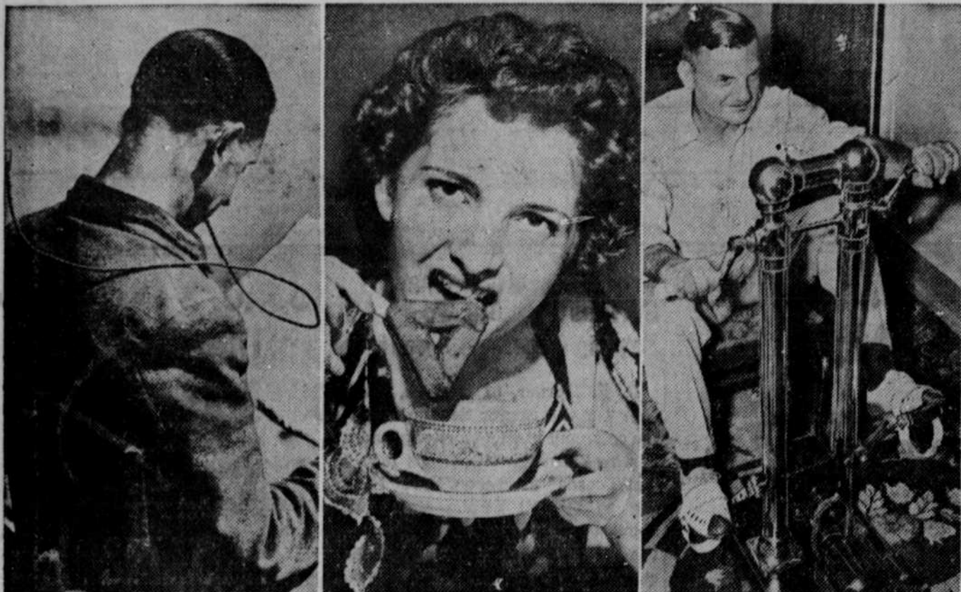
The inventive mind is never at rest, and here is pictorial proof. The ingenious device at the left is a flexible cigarette holder, guaranteed to keep smoke out of one's eyes. Center: The dunking enthusiast's fingers are now protected against hot coffee. This new doughnut is fried together with a handle, making for both safety and grace. It was demonstrated at a recent inventor's congress in Chicago. Right: A boon to the lazy man is this streamlined mechanical horse, demonstrated by Max Carey, former manager of the Brooklyn Dodgers. Its purpose: Maximum exercise with minimum effort.