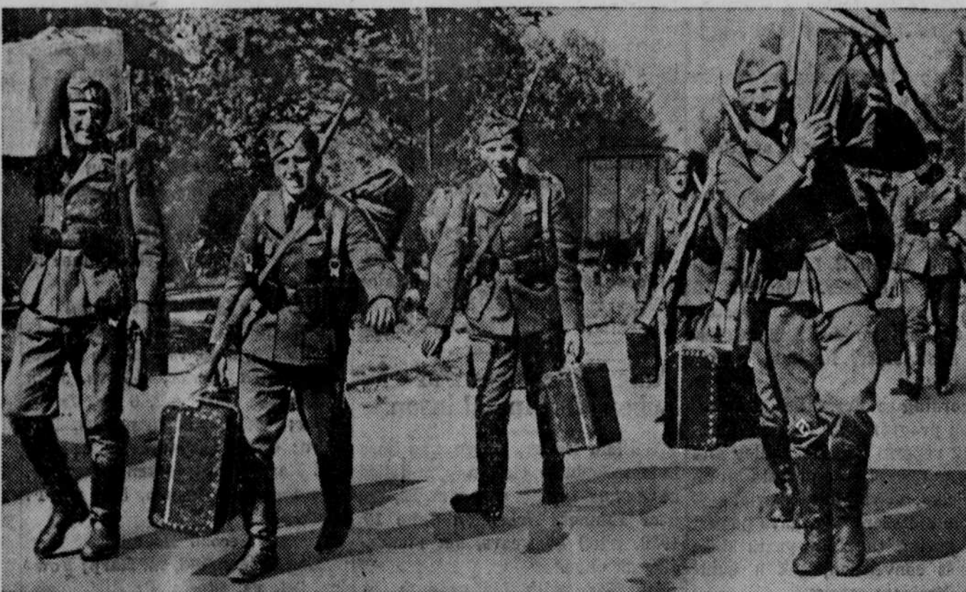
Happy to leave Spain after 33 months of war were these German soldiers, volunteers in the Franco forces, bound for the German ship which would convey them to Hamburg and their loved ones. Some 6,000 troops of the Reich were permitted to embark for their homeland after a gala victory demonstration in Madrid.