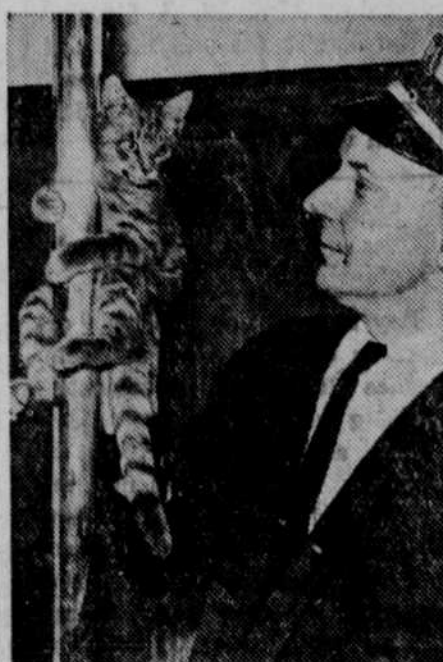
Firemen in a Cambridge, Mass., station are proud of "Sparky," a three-month-old kitten who obeys all the rules. The mascot is shown as she slides down the pole at the sounding of an alarm, following one of the firefighters.