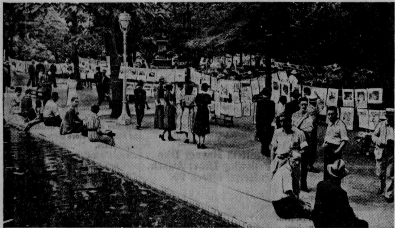
Art flapped on clotheslines as a brisk wind swept through Rittenhouse square in Philadelphia, Pa., recently. It was the annual three-day outside exhibit sponsored by the Art League of Philadelphia. Several hundred oils, water colors and etchings were on display and for sale. Thousands of interested spectators filed past the displays.