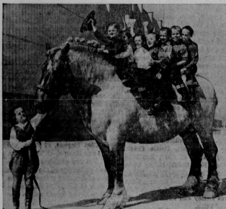
Here's a real study in contrasts at San Francisco's Golden Gate International exposition. When the little growups of a side show decide to go horseback riding, they don't have to take turns. No matter how many midgets are around, they all climb aboard Brooklyn Supreme, the world's largest horse. The Belgian stallion weighs 3,270 pounds.