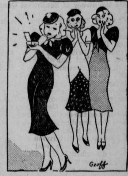
Fresh lipstick gives your morale a boost.

A pride in your personal appearance is a health barometer. If you lack vanity you are not in normal health. A woman without vanity is