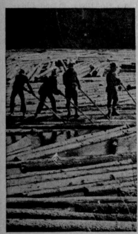
After the spring breakup in Maine, logs are drifted down rivers to the saw mills. It's the job of these log rollers, with caulked shoes, to keep the lumber moving.

England's forests. During the Seventeenth and Eighteenth centuries, naval reserves meant oak, not oil, but Queen Elizabeth and her Stuart successors squandered the royal forests to provide increased revenues independent of parliament, while admirals protested. There was a scarcity of oak timbers, and the white pine of New England gradually became England's chief source of the masts sorely needed by its