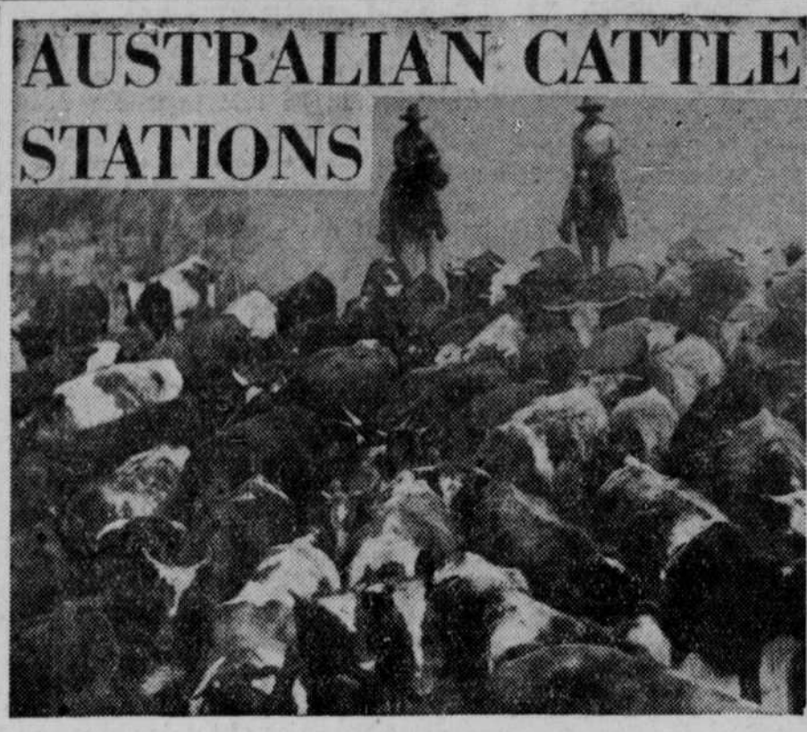
Australian cowboys "mustering" cattle.

For the lazy man, veteran ice cream eaters recommend the for . . . the climax of all this circular stroke, attained by twirling business. As a final gesture the exthe cone in the hand. Meanwhile the perienced ice cream cone eater can tongue is pushed forward gingerly. bite off the bottom and suck his re-This is a cleanup stroke, removing freshment downward. But you must be good to do this!