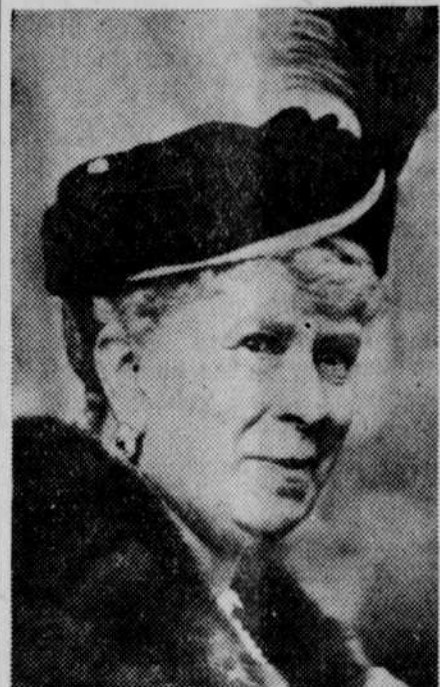
Queen Mary, mother of King George VI, had a gracious smile for the photographer who snapped her photograph as she was leaving the Exhibition of Handicrafts at the Kensington town hall in London for the benefit of the Metropolitan Borough Tuberculosis committee. The dowager queen appeared in perfect health.