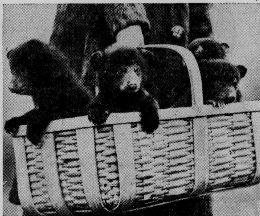
Orphaned when their mother was shot by a hunter in the Maine woods, these baby bears were found by a game warden near Augusta, and are being taken care of until able to fend for themselves. They are only a few weeks old. When they are a little more mature they will be released in the woods.