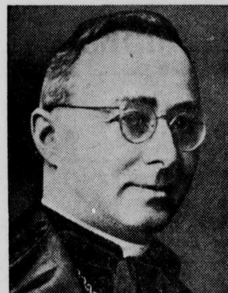
Cardinal Rodrigue Villeneuve, archbishop of the ancient see of Quebec, who recently announced that the National Eucharistic congress would be held in Quebec, June 22 to 26. In his announcement, Cardinal Villeneuve noted that the locale of the congress was well chosen because "Quebec is the cradle of the faith in Canada and North America."