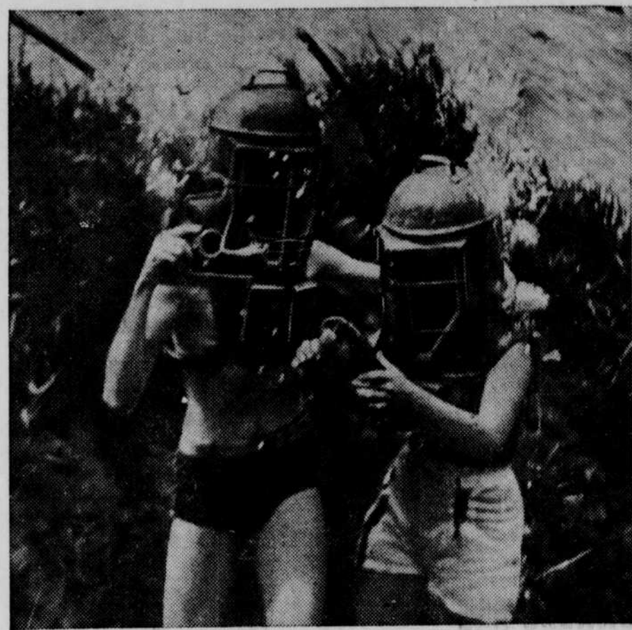
A boy and a girl student of the class of zoology at the University of Miami shown at the bottom of Silver Springs at Ocala, Fla., as they photographed a turtle while 20 feet below the surface. Clad in diving helmets the entire class took turns at exploring the springs' bottom as a departure in their nature studies.