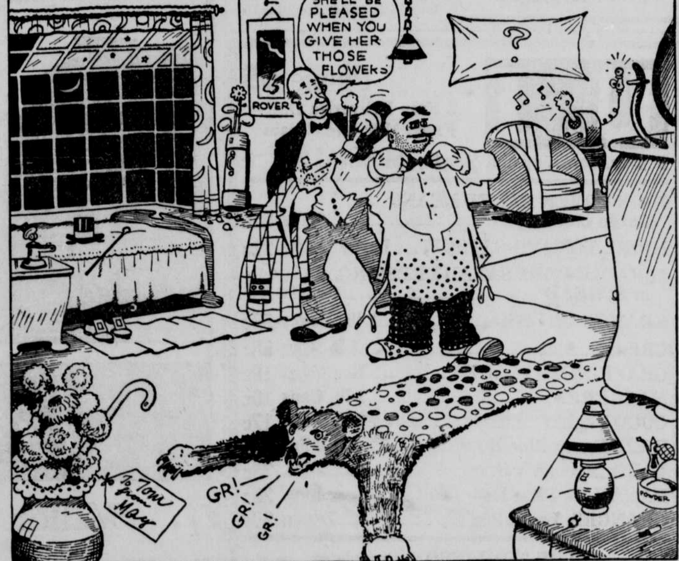
All dressed up and no place to go might well be the title of this inspiring scene. The importance of the occasion, we fear, must have warped our artist's mind, for the drawing is full of mistakes. Can you find fifteen? The answers will be found above.