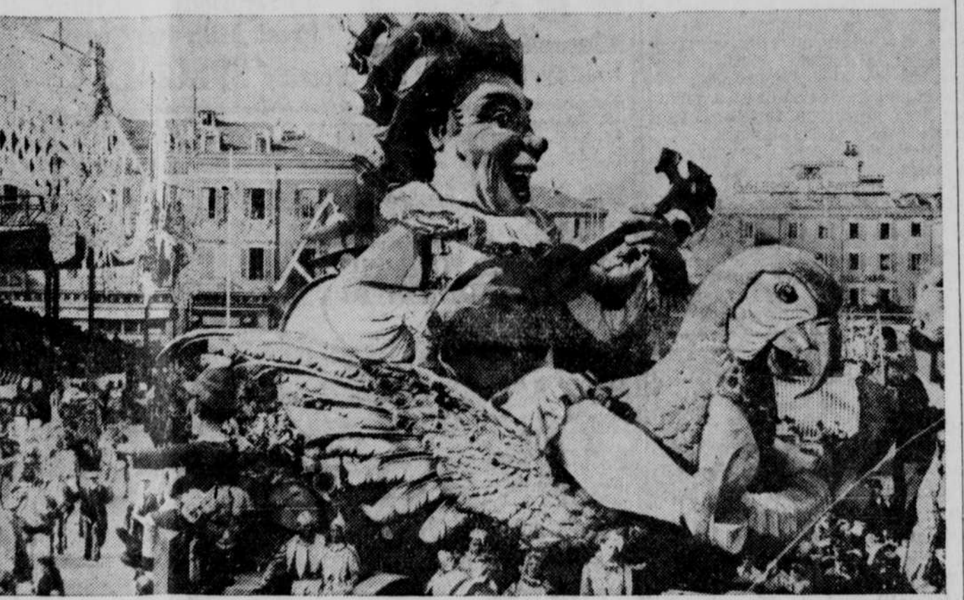
Climax of the brilliant social season at Nice, France, was the annual grand carnival which drew thousands of revelers from all parts of Europe. Here we see the float of His Majesty Carnival LX, which strikes the keynote of the festive occasion.