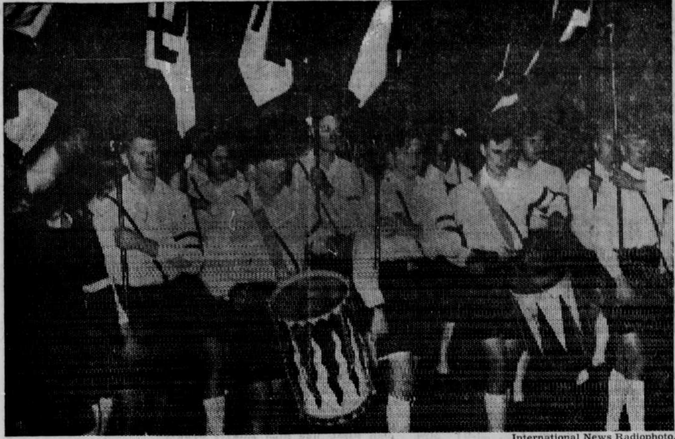
A contingent of the Hitler Youth Organization of Austria are shown parading through the streets of Vienna in celebration of the Nazis' triumphant march into Austria. The successful Nazi coup spelled the end of Austria's existence as a nation and its beginning as a state of the German reich.