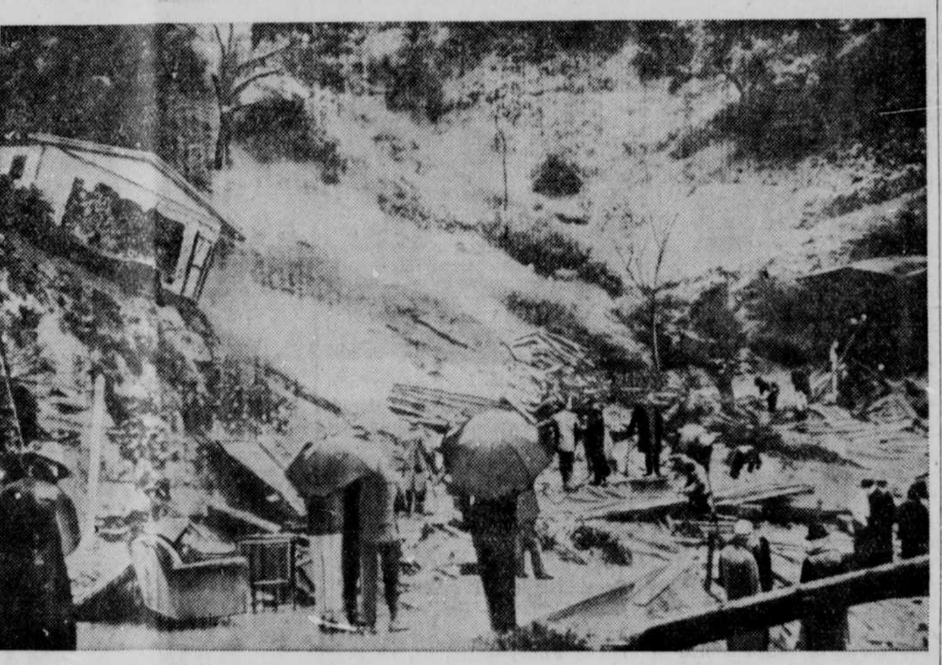
Swept by raging flood waters and southern California's worst storm in 64 years, thousands of people were made homeless. One of the many homes left in ruins is shown hanging precariously on a hillside as survivors search wreckage for bodies nearby.