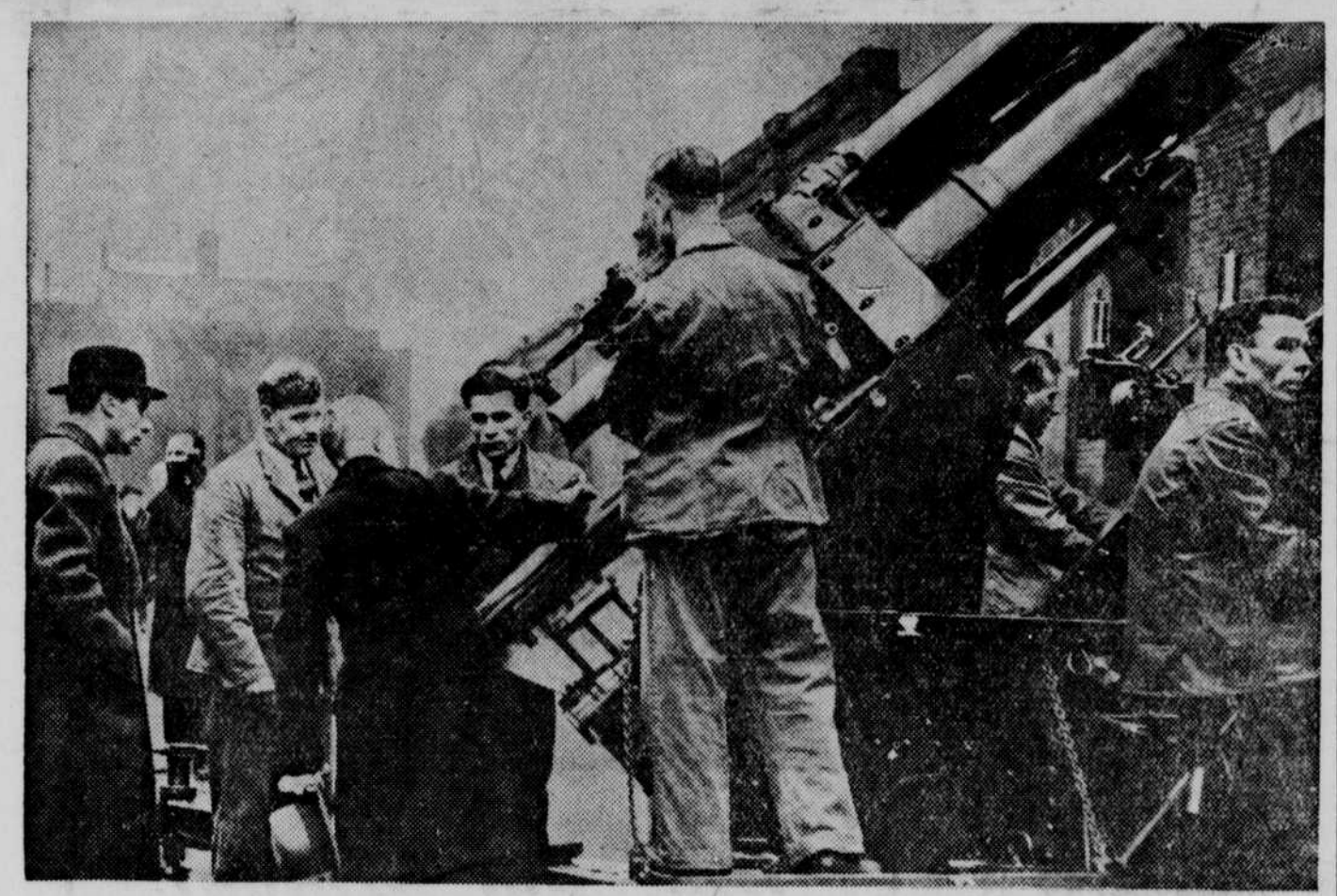
King George VI, making a surprise visit to the Wool wich arsenal on the outskirts of London, inspects a new 317 anti-aircraft gun. It was the first visit of his majesty to an arsenal since he ascended the throne last year. The monarch was pleased with the progress of the empire's rearmament program as it was revealed in his tour of the arsenal. As Britain begins its conferences with Italy designed to appease Europe, Prime Minister Chamberlain announced that the rearmament program will be expanded rather than curtailed.