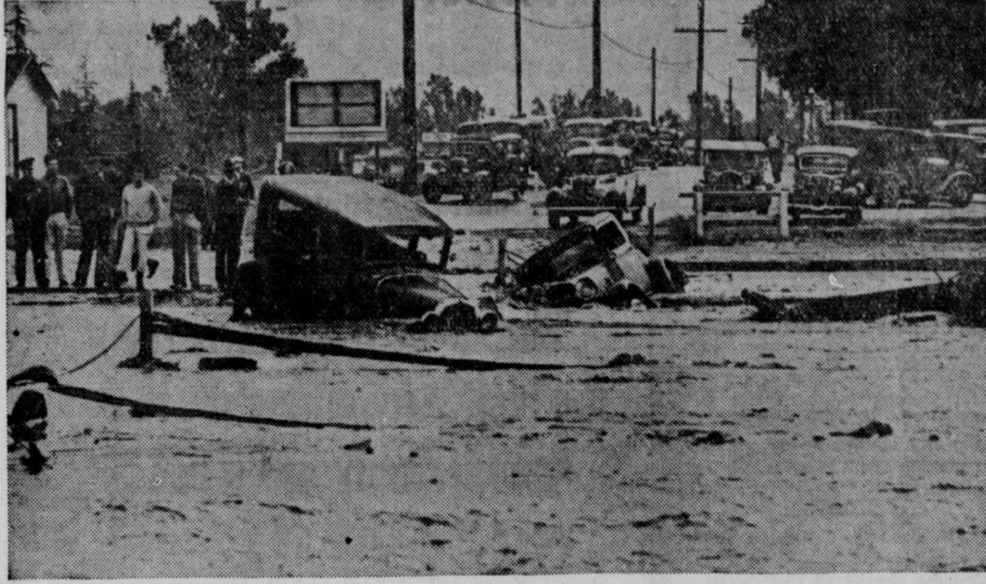
Raging flood waters caused by torrential rains which swept Los Angeles and other southern California communities wrought damage running into many millions of dollars and cost the lives of scores. Photograph shows automobiles washed off the road by flood waters on Victory boulevard in Hollywood.