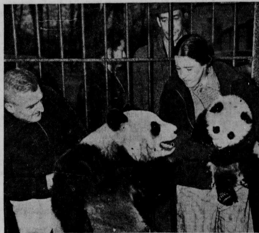
Mrs. Ruth Harkness, New York society woman, shown holding the new giant baby panda, Mei-Mei, after a 15,000-mile trip from her native Thibet, as she introduces her to her sister, Su-Lin, during their arrival at the Brookfield zoo, near Chicago. As can be seen, Su-Lin presents anything but a friendly welcome to her new playmate.