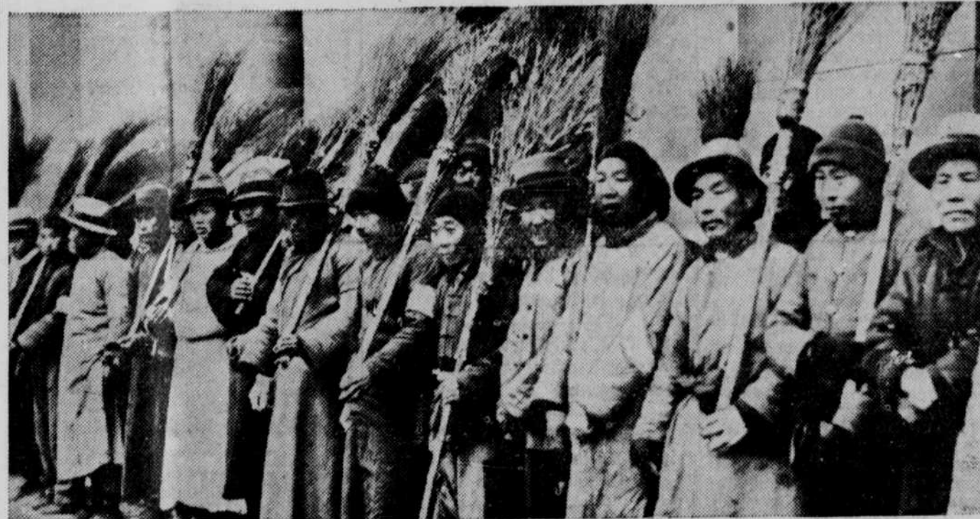
Members of the "sweep up and clean up" brigade of enforced Chinese labor shown at Nanking. The Japanese forces in control of the city have organized the civilian refugees into various bodies.