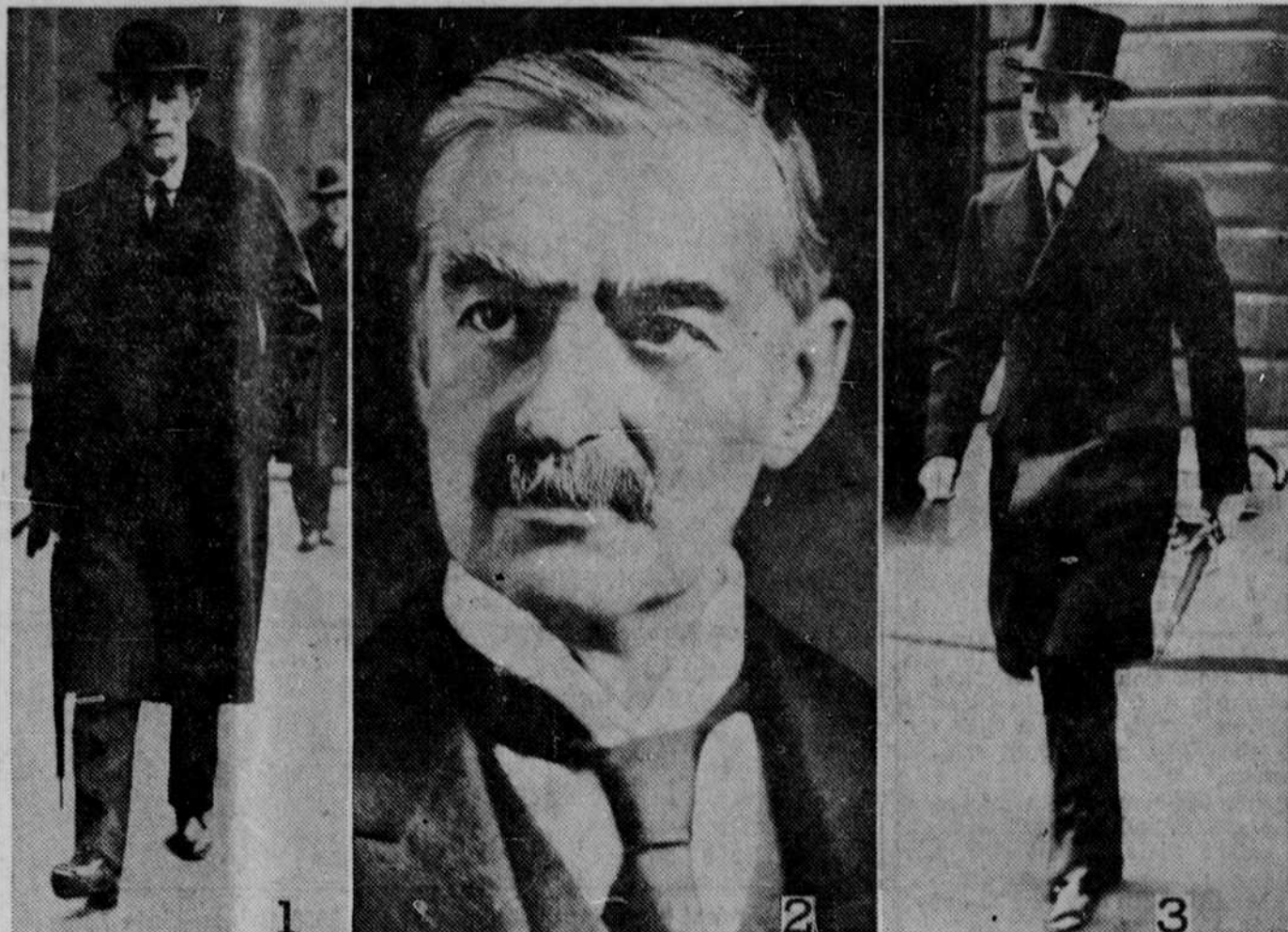
1—Lord Halifax, who was placed in charge of the British foreign secretary's office, following the resignation of Anthony Eden in one of the most dramatic cabinet upheavals of the present generation. 2—Prime Minister Neville Chamberlain of England, whose policy of seeking an immediate understanding with Premier Mussolini led to Eden's resignation. 3—Anthony Eden, foreign secretary who resigned rather than pursue Italian friendship, talks about circumstances which he held would indicate that Britain was yielding to pressure.