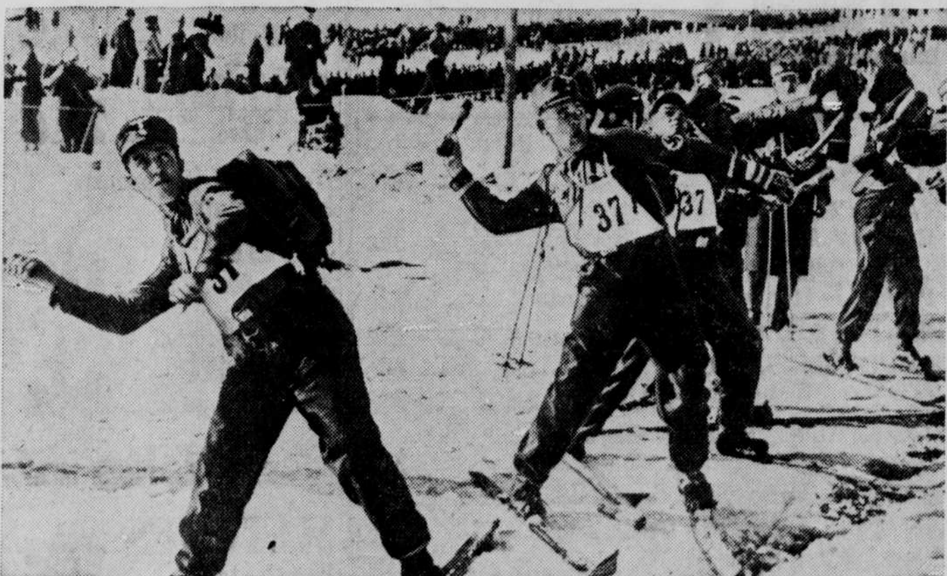
Apparently no phase of fighting is being left to chance by Dictator Adolf Hitler of Germany. Various branches of his armed forces are even now receiving war training on skis as witness this picture made on the snow-covered mountain slopes near Oberwiesenthal. Members of the police force, the army and storm troopers practice grenade throwing on skis, by using small clubs shaped like the deadly weapons. To make the exercises more interesting, the training takes the form of a contest.