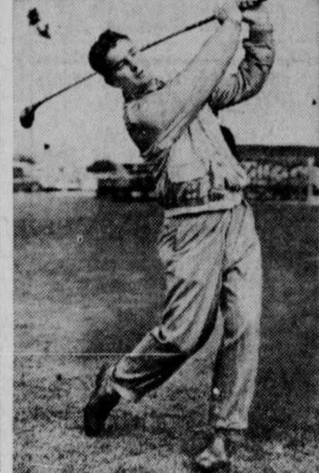
Here's the smooth swing of Jimmy Demaret, young Texan who hit them far and hard as he defeated Sammy Snead 4 and 3, in the finals of the recent National Match play open at the San Francisco golf club. Demaret showed ease of execution and a coolness under pressure.