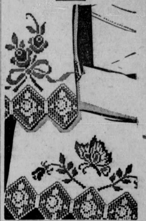
Pattern No. 1422.

Two's company and a smart combination when you team up dainty crochet and fetching 8 to the inch cross stitch in a stunning motif for towels, pillow cases or scarfs! Either crochet or cross stitch may be used alone. It's effective to use a monogram with the crochet. Pattern 1422 contains a transfer pattern for two motifs 6 1/4 by 9 1/2 inches, two motifs 5 1/4 by 5 1/2 inches, two motifs 4 1/4 by 10 1/2 inches and two 5 by 7 1/4 inches; directions and charts for the filet crochet; material requirements; illustrations of stitches used; color suggestions.