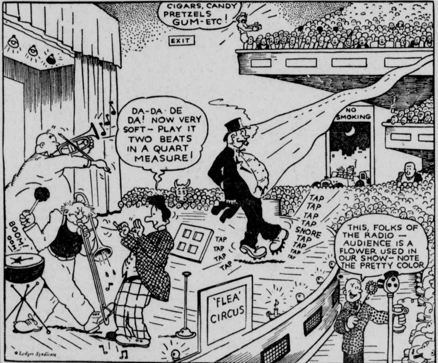
While at the theater the other night our aspiring young artist made this picture of what he saw around him. There are, however, fifteen mistakes in the drawing. Can you find them? Answers will be found above.