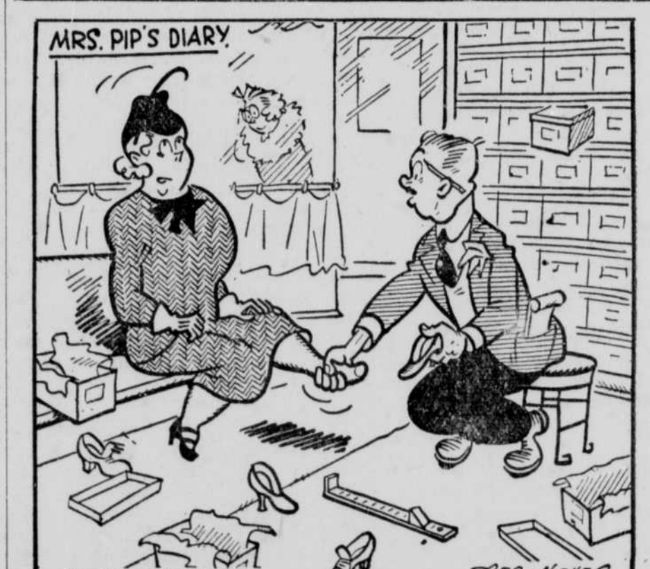
"That feels better . . . but it's still a little snug."