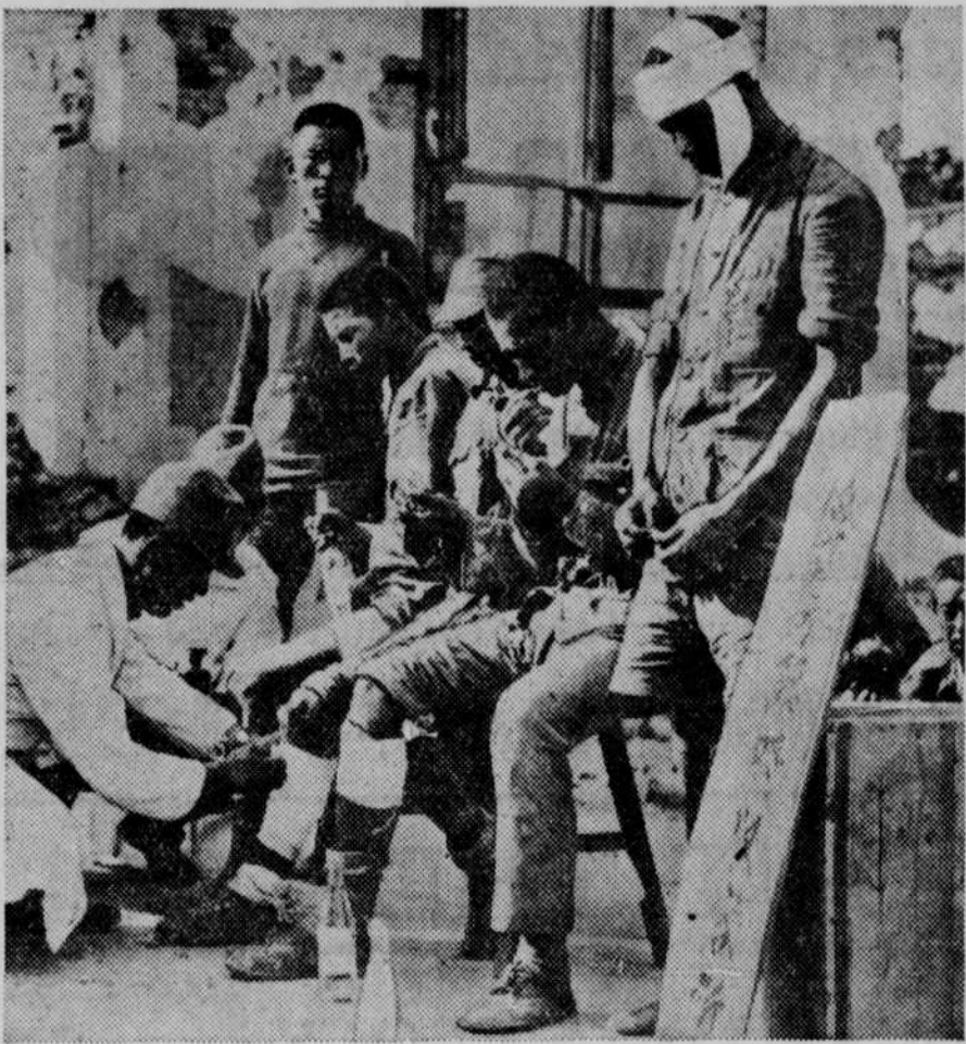
Two Japanese doctors minister to five wounded Chinese captives in the North China area. Notice the candy and pop bottles held by the captives. Can the Japanese be pampering prisoners?