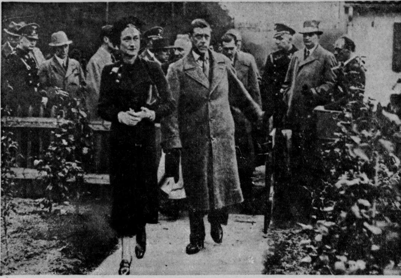
The duke and duchess pictured during a tour of inspection of Siemenstadt, the Siemens workers' colony near the great electric factory in Berlin. The distinguished visitors were escorted by Hermann von Siemens, who acted as guide and explained that his company cared for 150,000 workers from various parts of Germany.