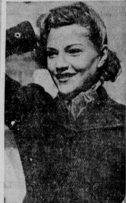
Lovely Annabella, famous French movie actress, shown after her arrival in the United States from Paris. The personable screen star has been signed for a series of pictures in Hollywood.