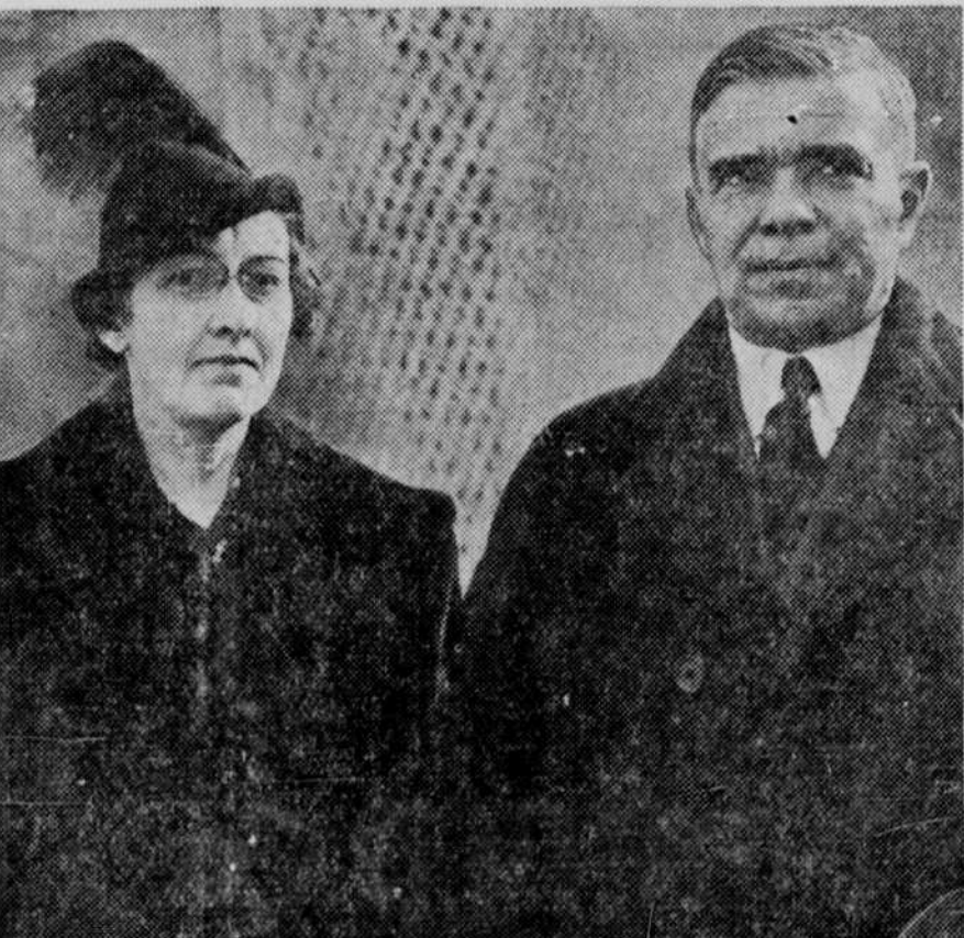
Pictured after their recent arrival in the United States from Russia are Alexander A. Troyanovsky, Soviet ambassador to the United States, and his wife. The envoy returned to Washington to resume his duties.