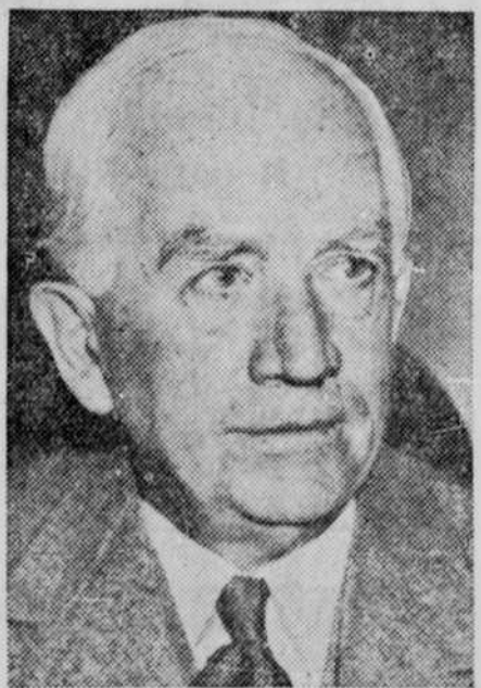
ence in Brussels, Belgium. For discussion among the conferees was the subject of Japan's current but undeclared war on China.

Norman H. Davis, who is President Roosevelt's "roving ambassador" and head of the United States delegation to the nine-power conference in Brussels, Belgium. For discussion among the conferees was the subject of Japan's current but undeclared war on China.