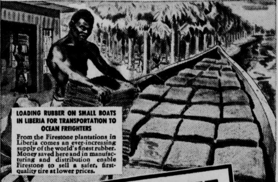
LOADING RUBBER ON SMALL BOATS IN LIBERIA FOR TRANSPORTATION TO OCEAN FREIGHTERS

From the Firestone plantations in Liberia comes an ever-increasing supply of the world's finest rubber. Money saved here and in manufacturing and distribution enable Firestone to sell a safer, first-quality tire at lower prices.