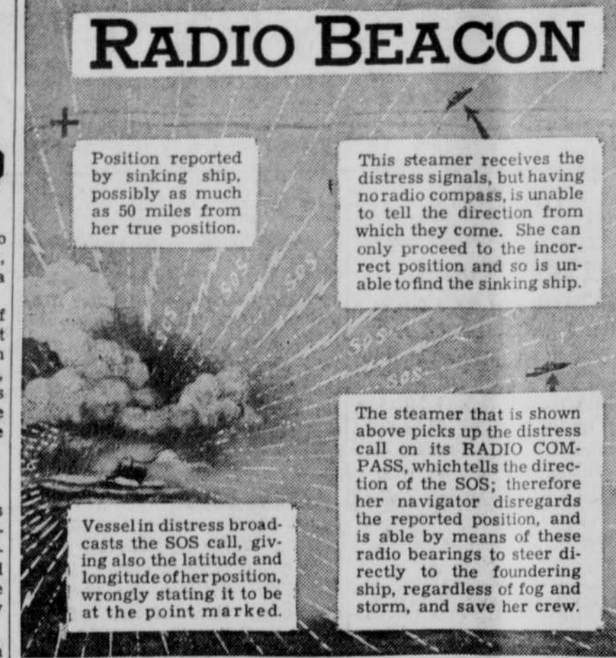
Rescuing Vessel Locates Ship That Gave the Wrong "Address."

Prepared by National Geographic Society, Washington, D. C.-WNU Service.