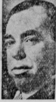
Irvin S. Cobb

Still, they do say Mrs. Simpson is pretty handy with a skillet, which, on the cook's Thursdays off, ought to save getting in extra kitchen help; and what with there being no crown jewels to keep polished and installment houses just crying to help all young honey-mooners out—you furnish the bird, we furnish the nest!—Well, by scrimping, the couple should get by, don't you think?