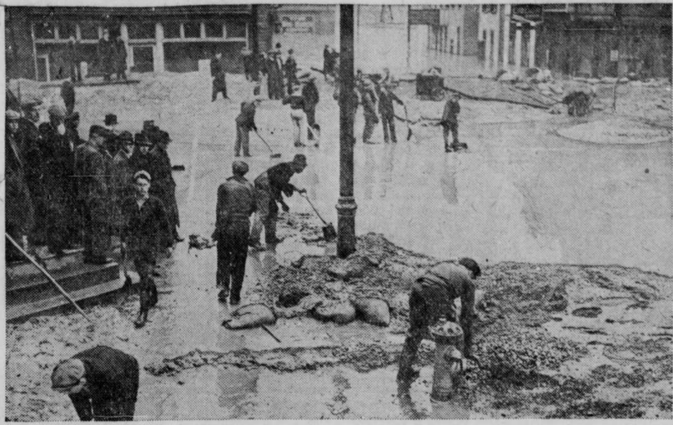
With shovels, brushes and pumps workmen clear ponds of water and heaps of gravel and dirt from the approach to Suspension bridge at Covington, Ky., as the flood waters of the Ohio river receded. This city was almost completely inundated during the flood.