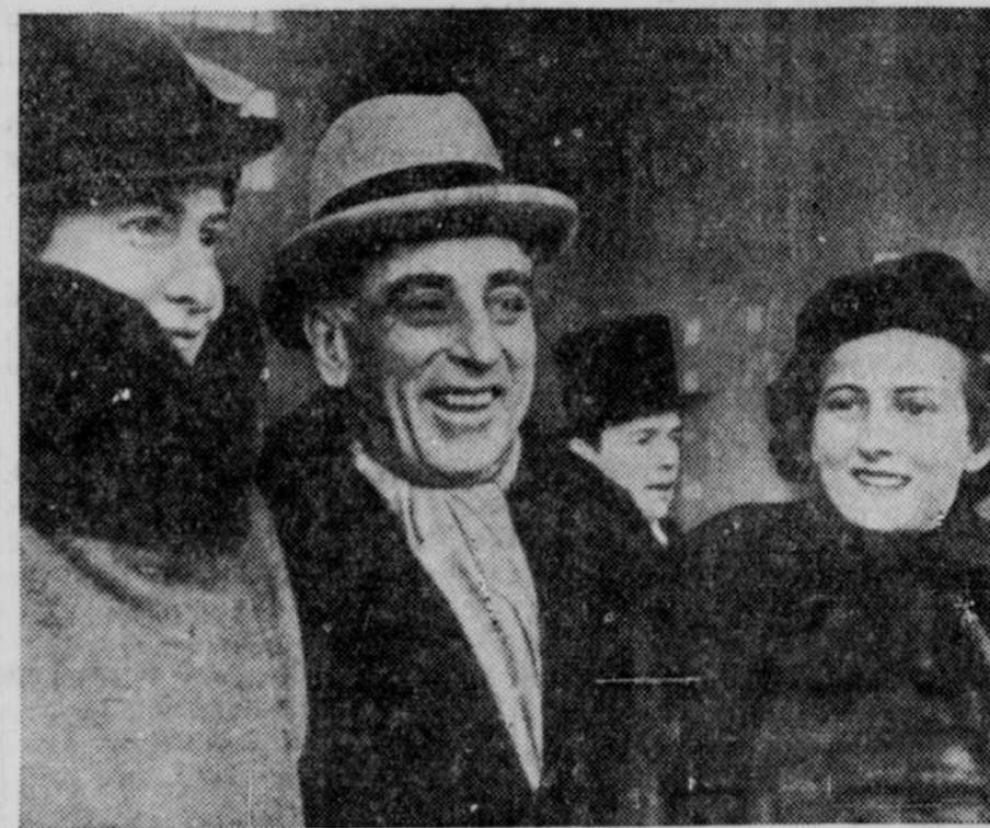
The Hon. Joseph Davies, newly appointed ambassador from the United States to Soviet Russia, is shown with his bride (left), the former Mrs. Edward F. Hutton, and his daughter, as they arrived in the Russian capital recently.