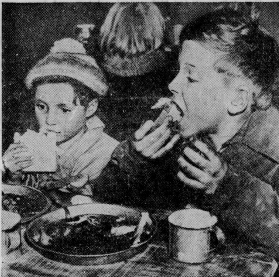
Unperturbed by their flight from the alluvial agricultural area of Arkansas, these children are seen eating at the refugee camp at Memphis, Tenn., with full enjoyment of the meal. All the roads from Arkansas into Memphis were clogged with refugees.