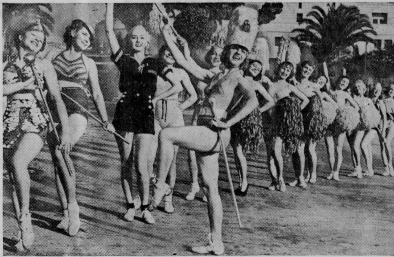
Participants in the annual community swim at Long Beach, Calif., when residents and visitors take part in beach and aquatic sports climaxed by a dip en masse in the surf. These aquatic events are held within sight of snow-covered mountains.