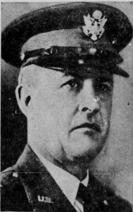
Gen. Malin Craig, chief of staff of the U. S. Army, who had direction of the task of combatting the flood waters of the Ohio and Mississippi rivers, strengthening the levees, evacuating refugees from danger zones, providing shelter and preserving order in various areas. The U. S. Engineer Corps performed invaluable service in calculating the extent of the floods, the height of the water and in strengthening the levees.