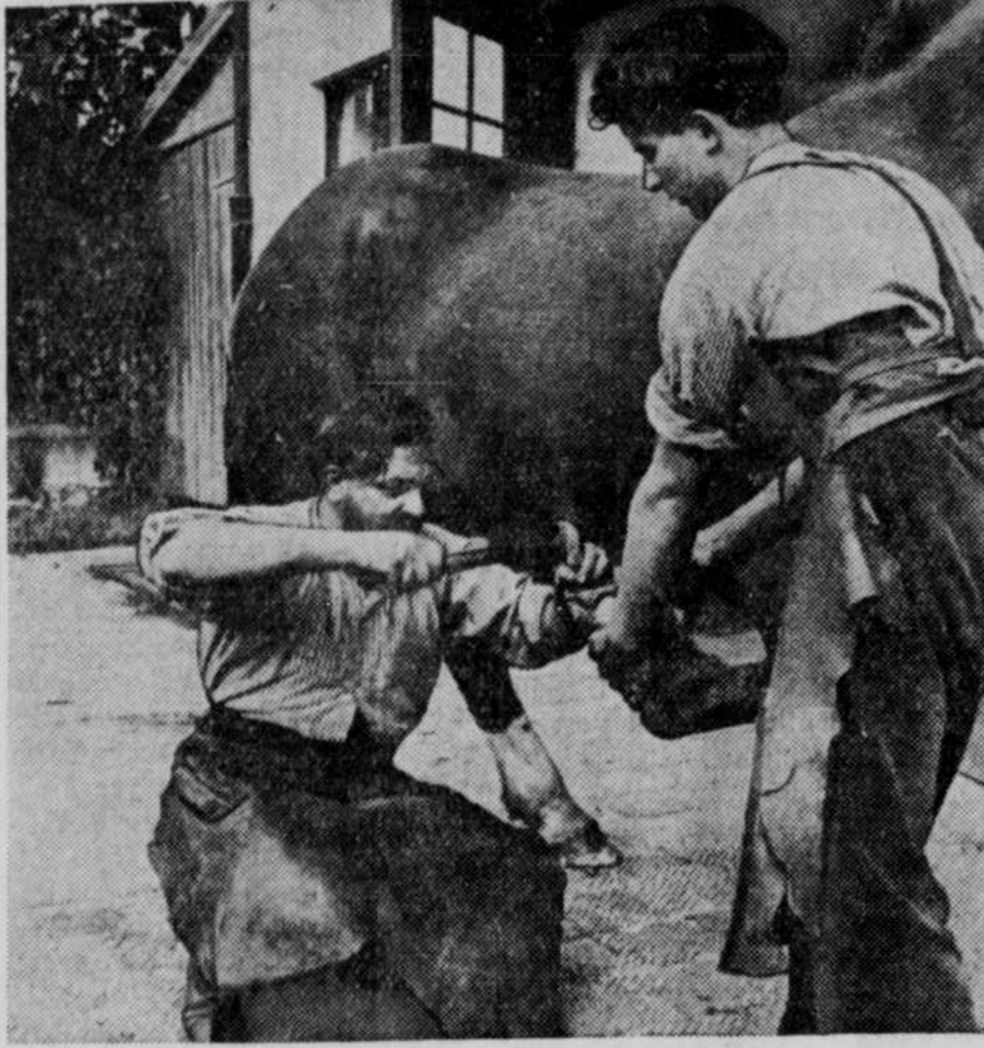
"Calaphas" of Oberammergau Is a Blacksmith.

Prepared by National Geographic Society, Washington, D. C.—WNU Service.