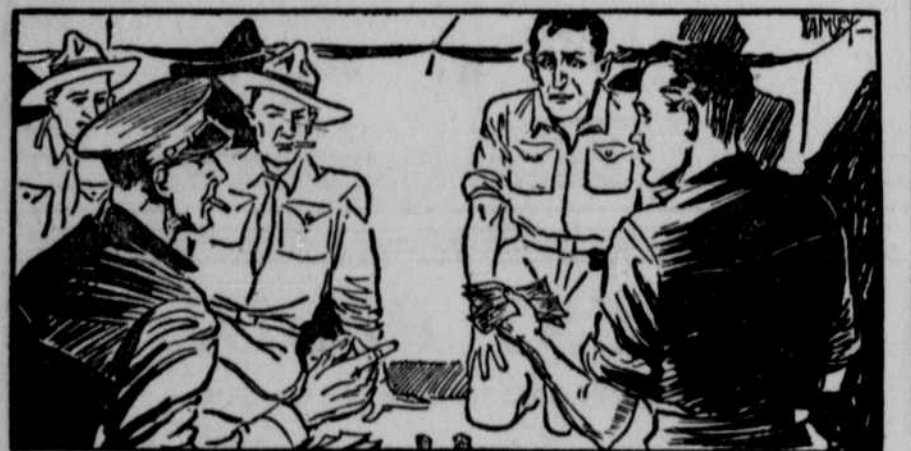
The Argument Got Pretty Hot for a Minute.

There were three men in the tent—a sergeant named Joe and two privates, Bill and John. The sergeant had been drinking, and he rolled