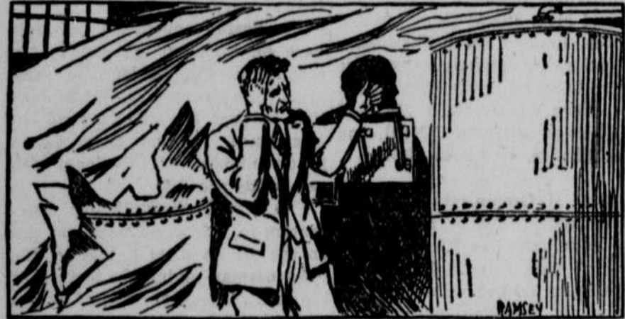
Bill Got to the Switch and Snapped It Off

The first thought Bill had was one of surprise to find that he was still sitting in his chair. He was cut in half a dozen places about the face and arms by bits of flying glass, but otherwise he seemed to be