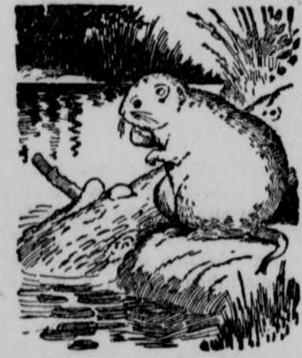
It Seemed to Jerry That He Simply Must Have Those Pieces of Carrot.

JERRY MUSKRAT was puzzled. He was very much puzzled. When he discovered that the stranger had left pieces of carrot and apple at some of Jerry's favorite eating places he had guessed at once that a trap had been set in each one of those places. So, for a whole day he had kept away from them. Then curiosity had been too much for