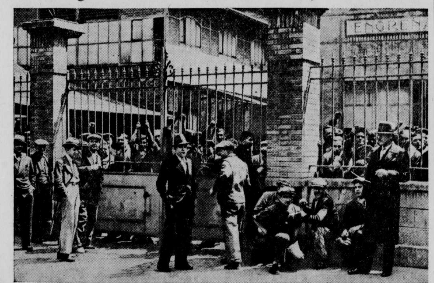
During the general strike which ushered in the new "popular front" government in France, striking workers took over industrial plants. At the Citroen automobile works, strikers within the gates are cheered by comrades as they "hold the fort."