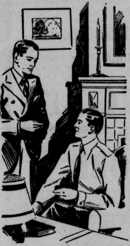
"We're Out to Fight These Men."

STORM MUSIC By DORNFORD YATES COPYRIGHT BY MINTON, BALCH, & CO. W. H. S. SERVICE CHAPPTER I — 1 — I Attend a Funeral. IF MY cousin, Geoffrey Bohun, had had to work for his living, he would, as a painter of portraits, have made his mark, but work within doors he would not, and since he cared nothing at all for riches or fame, he painted old buildings and landscapes and lazy streams, and though I think that he painted these very well, the public would not have them, but clamored for portraits instead. Whether Geoffrey was right or wrong, I cannot pretend to say, but I must confess that I was glad of his choice, for since my parents' death I had lived with him, and the work he preferred made us free of the countryside. Indeed, of the four