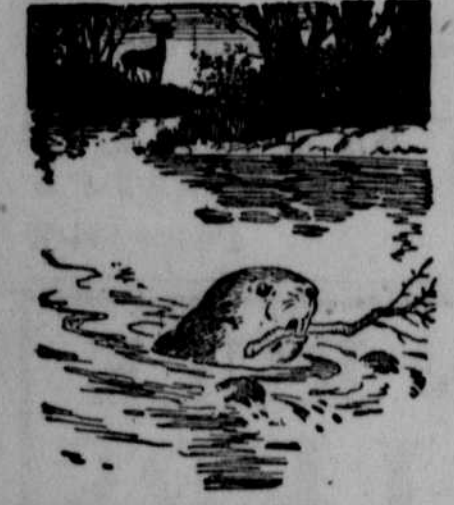
It Was Paddy the Beaver Taking the Branch to His Woodpile.

When Lightfoot the Deer bounded away through the Green Forest after watching the hunter pass through the hollow below him, he remembered Paddy's pond. "That's where I'll go," thought Lightfoot. "It is such a lonesome part of the Green Forest that I do not believe that hunter will come there. I'll run