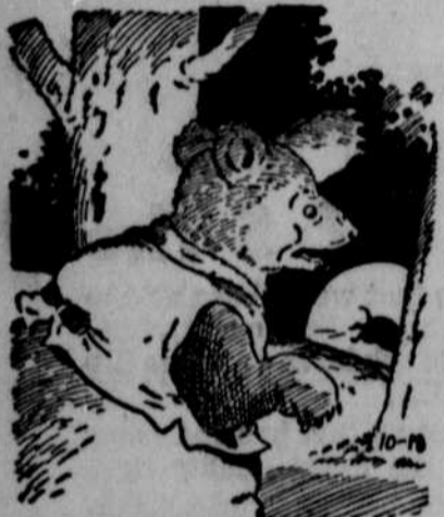
Danny Had Darted Behind a Big Tree.

IF EVER in all the Great World there was a startled Bear, that one was Buster Bear when Danny Meadow Mouse ran straight at him. Beechnuts were in Buster Bear's mind, sweet little beechnuts and nothing else, when he reached out a great paw to rake over that pile of leaves. It didn't enter Buster's head that there might be anything but beechnuts under them. So, when Danny Meadow Mouse with a frightened squeak darted out from