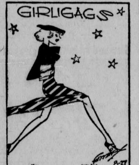
"The world isn't so small after all," says Reno Ritzl, "just try going some place where you don't wish to be seen."

"Flowage Rights" The expression "flowage rights" refers to the right of overflowing land when a dam is built for the purpose of furnishing irrigation or power. The person whose land is overflowed has a right to compensation for any loss. When the right of overflowing a person's land is purchased, this is referred to as flowage rights.