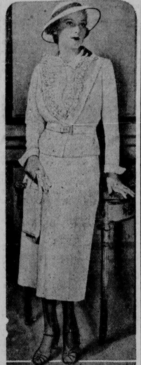
Lucien Lelong shows a white peasant linen blouse having a shirred jabot edged with blue and red peasant embroidery with his tailored suit of heavy white silk shantung linen. The collar is blue velvet and the buttons and buckle are of a gold colored metal.