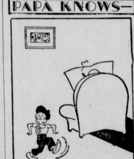
"Pop, what is a reign?" "Scenic railway." C Bell Syndicate.-WNU Service.