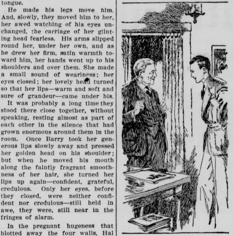
felt an excitement of silent rushing | Kerrigan's Look Was Amused and Curious. "Like the Bottom of a

But what the dickens had been all the trouble last night? All that momentous entanglement with chivalry and speechlessness, just because the break had come before he had expected it? He had done a very sound thing; he had saved himself from a premature enthusiasm that would have mixed up the rest of the trip a good deal; but there was nothing so very momentous about it. It was enough for one evening to see her defenses go down; her trust of him, taken