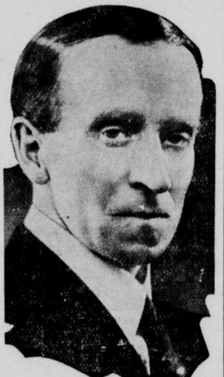
Col. John Buchan, the author, will succeed Lord Bessborough as governor-general of Canada. He is the first commoner to be appointed to the post.