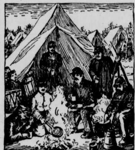
Eating Their Breakfast Around the Bivouac Fires.

SOUND the taps softly For heroes asleep. Strew flowers richly, Our loyalty keep. Sing their songs bravely— "We're Tenting Tonight," "Marching Through Georgia," And "Justice and Right." Songs for the Riders Who took San Juan hill, "A Hot Time" and "Dolly" We're singing them still. Songs of the laddies Who marched "Over There" "Keep the Fires Burning," And "Pack Up Your Care." Songs for our heroes, Sweet flowers for them, too. Soldiers in khaki And brave boys in blue. Banners wave o'er them, And tears for them shed, From Shiloh to Flanders, Our loved, honored dead.