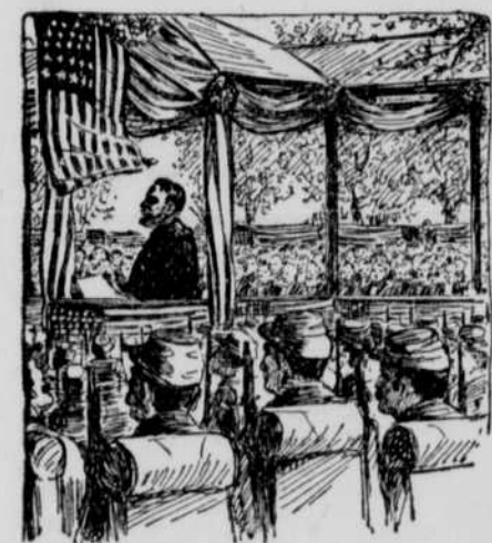
Grant's Address to the Army Was a Memorable One.

In the pages of Harper's Weekly of that date, and in the reminiscences of Ben: Perley Poore, the veteran journalist, and other contemporary chroniclers, graphic accounts by eyewitnesses are given of the thrilling spectacle. The review was staged at one of the darkest moments of the nation's history. A month before Lincoln had been assassinated. At the very time the parade of the veterans was taking place, preparations were being made for the trial of Mrs. Surratt, Harold, Atzeod and Payne, charged in the Booth conspiracy, and at that time confined in the old penitentiary near the arsenal. Their trials be-