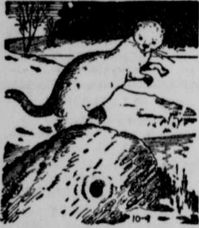
"You'll Have to Come Out Some Time and I'm Going to Stay Right Here and Wait for You," Declared Billy Mink.

DANNY MEADOW MOUSE was trapped. He was trapped, but not caught, which sounds rather mixed and isn't at all. You see he was trapped because Billy Mink was waiting for him just outside the only doorway to that hollow log in which he was hiding. But he wasn't caught, because that doorway was too small for Billy Mink