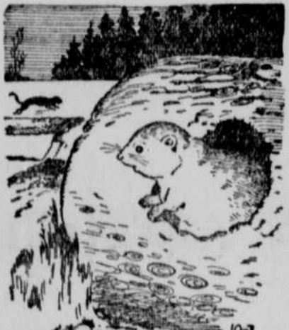
Crept to the Entrance and Peeped Out.

DANNY MEADOW MOUSE sighed with thankfulness and relief as he reached the other side of the Laughing Brook by way of the old log which had fallen across it, thus making a bridge. To be sure he was a long, long way from his snug little home, where Nanny Meadow Mouse was anxiously waiting for him, but at least he was on the right side of the Smiling Pool and the Laughing Brook.