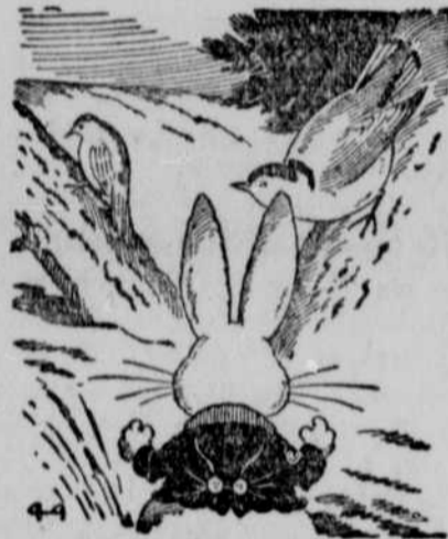
"Hello! There's Seep Seep."

Yank Yank shook his head. "No," he replied. "He hunts for a tree or an old stub with a piece of loose bark hanging to it. In behind this