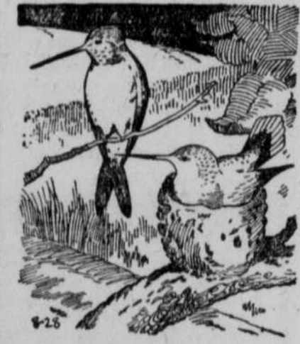
It Was Their Nest.

fin midair as he thrust his long bill into the heart of a flower to get the tiny insects there and the sweet juices he is so fond of. But this was the first time Peter had ever seen him sitting still. He was such a mite of a thing that it was hard to realize he was a bird. His back was a bright shining green. His wings and tail were brownish with