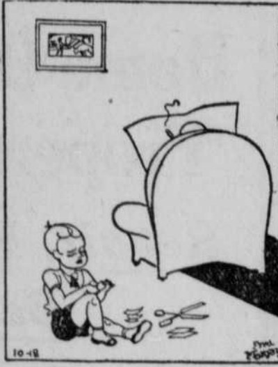
"Pop, what is meditation?" "Court plaster." @ Bell Syndicate.-WNU Service.