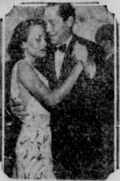
As Joan Crawford, screen star, took the first step towards a divorce and freedom from Douglas Fairbanks, Jr., Hollywood speculated as to the possibility of her marrying Franchot Tone, with whom she is shown dancing here. Tone, new romantic star of Irish extraction, has been Miss Crawford's leading man for some time.