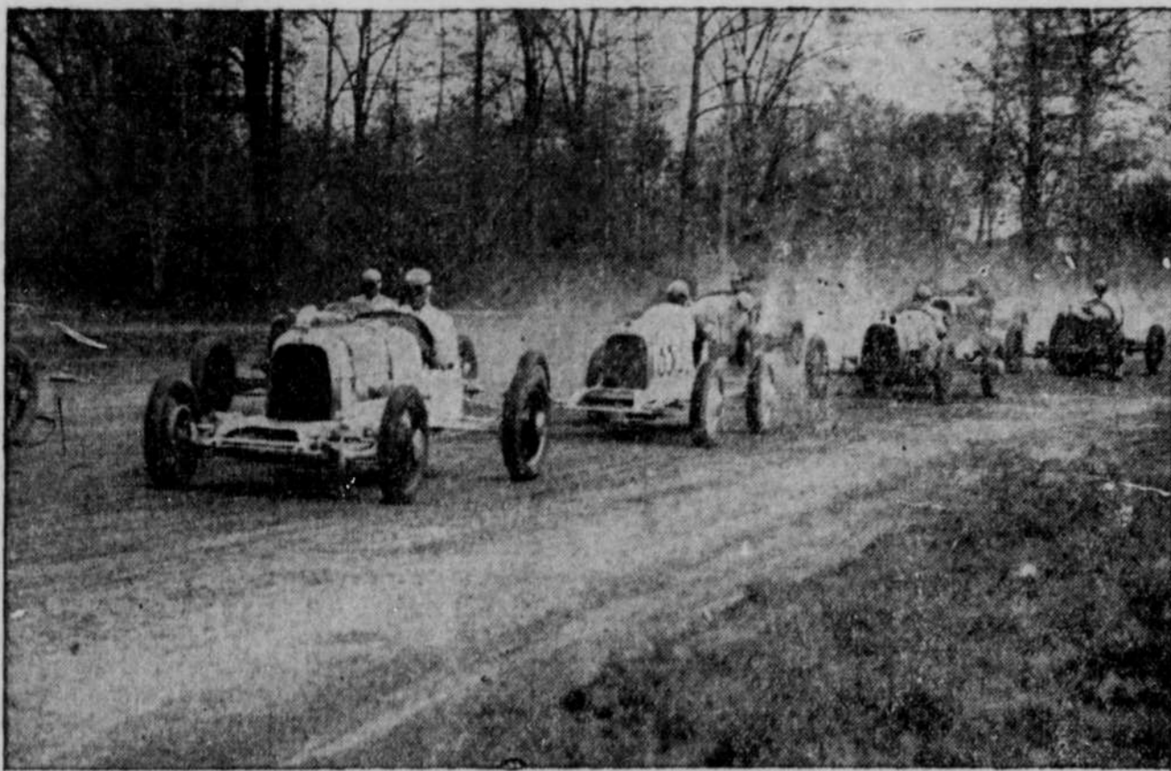
They're off for the Summer racing season on this dangerous little auto racing track at Troy Hills, N. J. It is only one-third of a mile in circumference. Here are the midget cars tearing around in the opening race recently. Auto racing has become the most popular sport of the Sunday crowd in New Jersey.