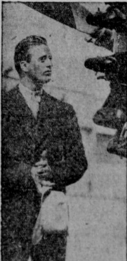
On his new job as general manager of the Gilpin Air Lines, Elliot Roosevelt, 22-year-old son of the President, is pictured as he went to work at Glendale, Cal. Young Roosevelt revealed he has been interested in aviation for the past six years.