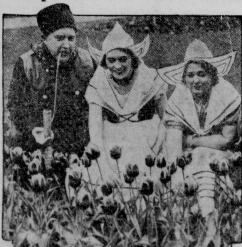
It is tulip time in Holland, the land of windmills. It is also tulip time in Holland, Mich., where, once a year, the residents of the quaint town cast off their American habits and return to the customs and attire of the land whence came their forebears to the New World. Here is a typical group, pictured in Dutch costume, admiring the blooms so reminiscent of old Holland.