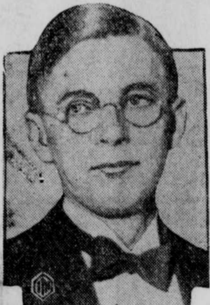
Dr. James Bryant Conant, noted authority on chemistry, who has been elected president of Harvard University to succeed Dr. A. Lawrence Lowell, resigned. Dr. Conant, who has been identified with Harvard as a student and teacher since 1910, is widely recognized as a leader in scientific research. He is only 40, one of the youngest heads the university ever has had.