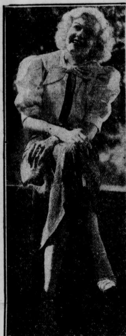
Now that the outdoor season is here, checks are coming into their own as a feature of milady's styles. Here is Jean Harlow, screen star, in a cute outfit of red and white pin-check. The skirt boasts box pleats in front, and is topped off by a tailored vest-jacket of white silk pique. The jacket sleeves are puffed at the shoulders.