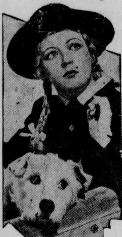
Looking as though she were more than equal to the situation, little "Peg O' My Heart" returns to American audiences in the person of Marion Davies, screen star, who is taking the role in the screen version of the famous play. Peg is here shown with her wistful pal, Michael.