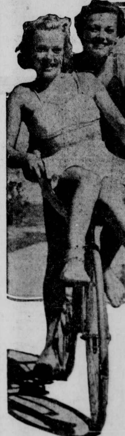
They may be dressed for swimming, but Eleanor Holm, Olympic mermaid, and Dorothy Lee are covering the miles with smiles and a bicycle. Both Eleanor and Dorothy are among the movie celebrities who have taken up the cycling fad in a big way.