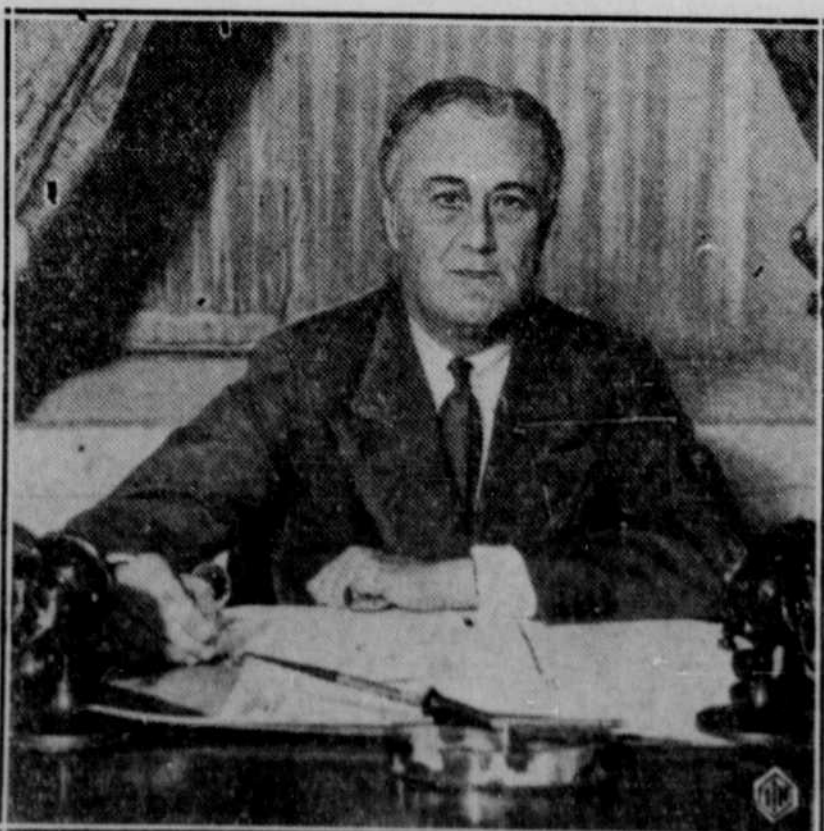
Accounting for his two-months' stewardship of the nation, President Roosevelt is pictured as he delivered a nation-wide radio broadcast from the White House on the economic situation—what has been done and what is to be done. The President explained his recovery program and promised to use the powers granted him by Congress if, and when, it becomes necessary.