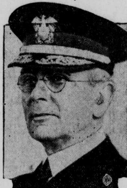
Vice-Admiral William H. Standley, who has been appointed new Chief of Naval Operations, the Navy's highest command, to succeed Admiral William Pratt, who reached the retirement age on March 1. However, Secretary of the Navy Swanson announced, Admiral Pratt will be retained pending definite action by the Geneva Disarmament Conference.