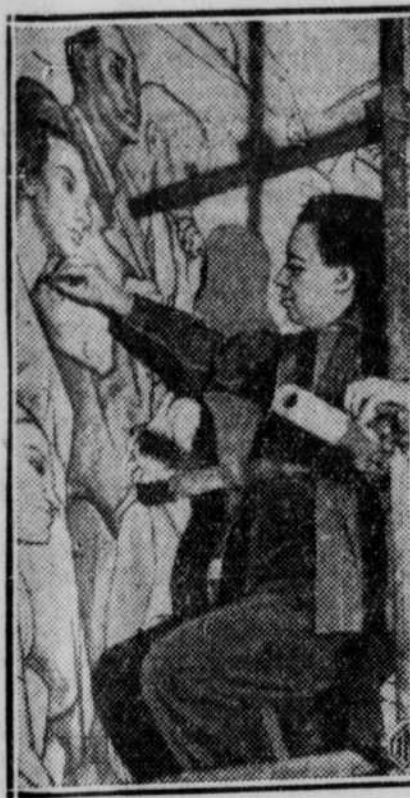
Diego Rivera, famous Mexican mural painter, who has become the storm center of a new controversy following his dismissal from Rockefeller Center, New York, where he had been engaged to paint a series of frescos. Rivera was ousted, it is said, because the scene of Communist activities he painted were not acceptable to the Rockefeller family.