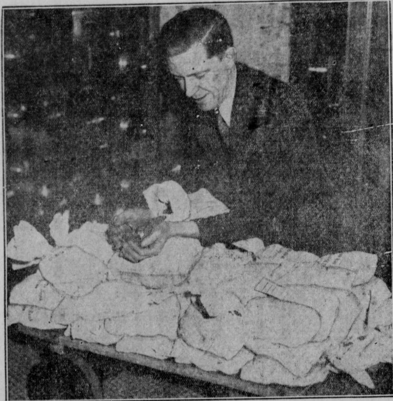
If you have ever wondered what $500,000 looks like, take a good look at this picture. All those little sacks are jammed full of gold coins which were returned to the vaults of the Fidelity Trust Company in New-ark, N. J., by hoarders who responded to Uncle Sam's plea. A flood of the precious metal has poured back into the banks of the nation in the last few days, due to the threat of Federal proceedings.