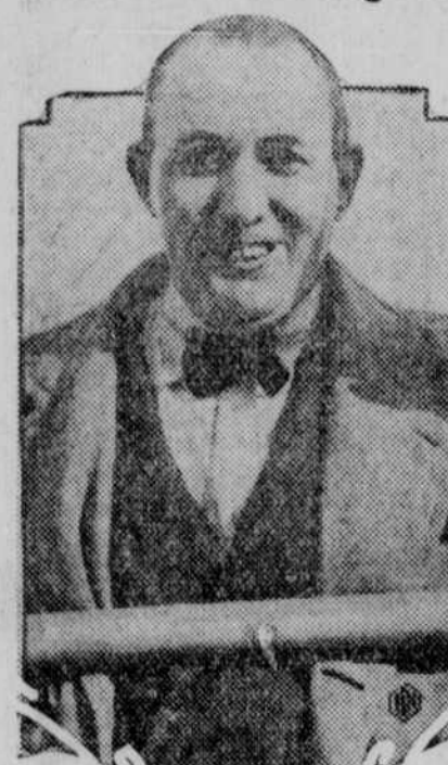
Robert L. Ripley, whose amazing "Believe-it-or-Not" cartoons have gained him world-wide fame, pictured as he sailed from New York on the liner Rex in an extensive hunt for new material. Rip will travel through Africa and across the Atlantic by air to South America, covering more than 15,000 miles on his quest.