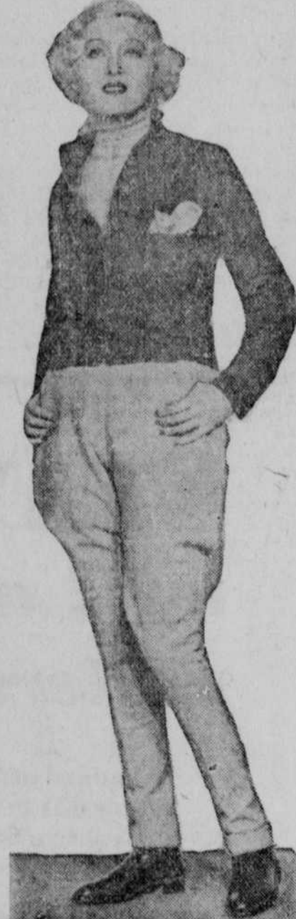
If you have a leaning towards equestrian pursuits, here is the last word in clothes for the occasion, according to Peggy Hopkins Joyce, screen player. Over a yellow, turtle-neck sweater, she wears a brown suede jumper. The jodhpurs are of beige whipcord, and the boots are brown cordovan leather.