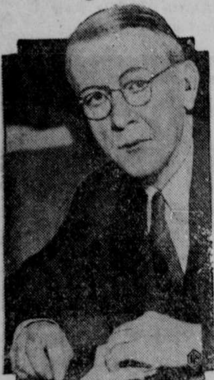
Frank J. Corr, who was elected to act as temporary Mayor of Chicago to succeed the late Mayor Anton J. Cermak. Corr, who has had much experience as an Alderman, will hold office until an election can be called. He is a Democrat, and was a close friend of his late predecessor.