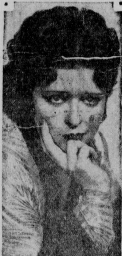
A new picture of Clara Bow, famous "It" girl of the films, who, it has just been revealed aided Scotland Yard, Britain's great man-hunting organization, in capturing a clever criminal. Miss Bow while in London was approached by the man who attempted to sell her a gold-making machine. The "It" girl "strung him along" until the time was ripe and then turned him over to police.