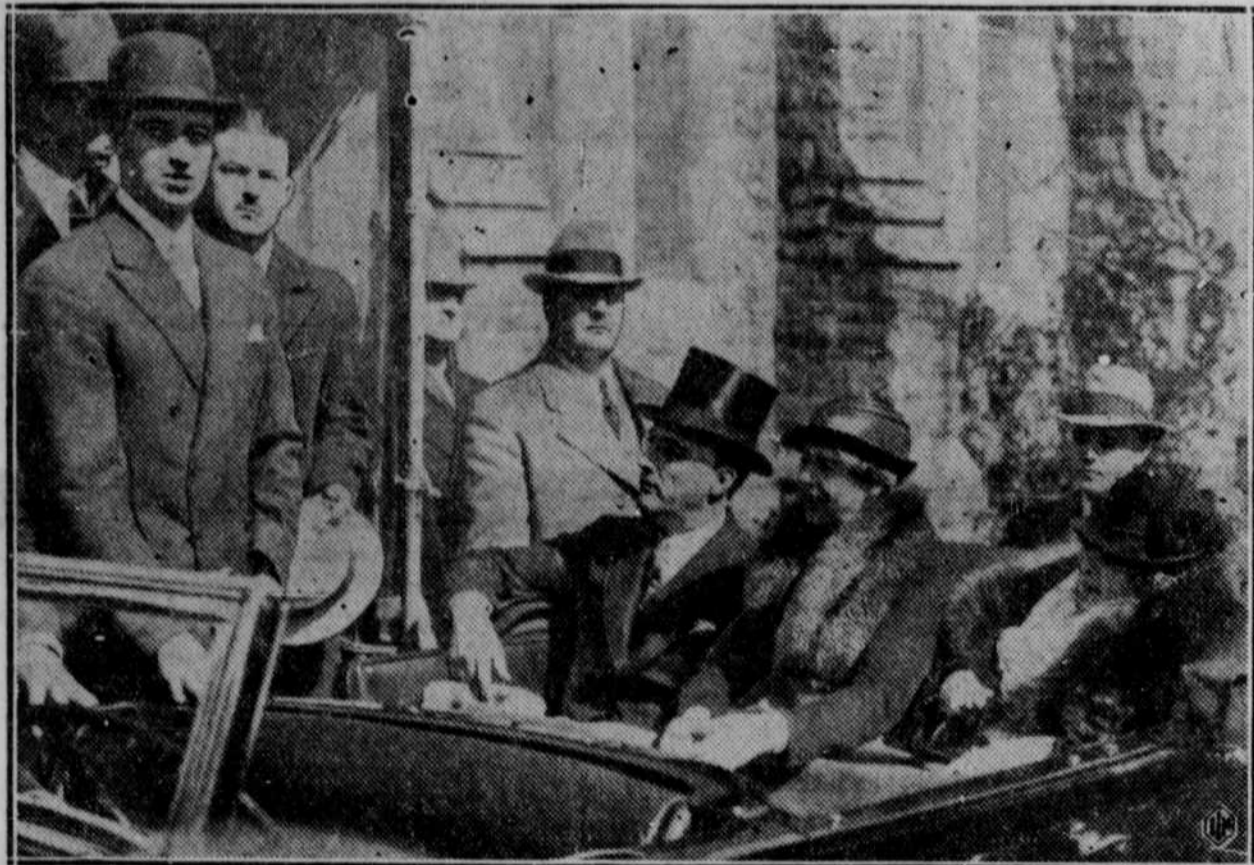
Beginning his first full day as Chief Executive of the United States President Franklin D. Roosevelt is pictured as he attended service at St. Thomas' Episcopal Church with other members of his family. At extreme left is James Roosevelt, son of the President; and in the automobile are President Roosevelt, Mrs. Roosevelt, wife, and Mrs. Sarah Delano Roosevelt, the President's mother.