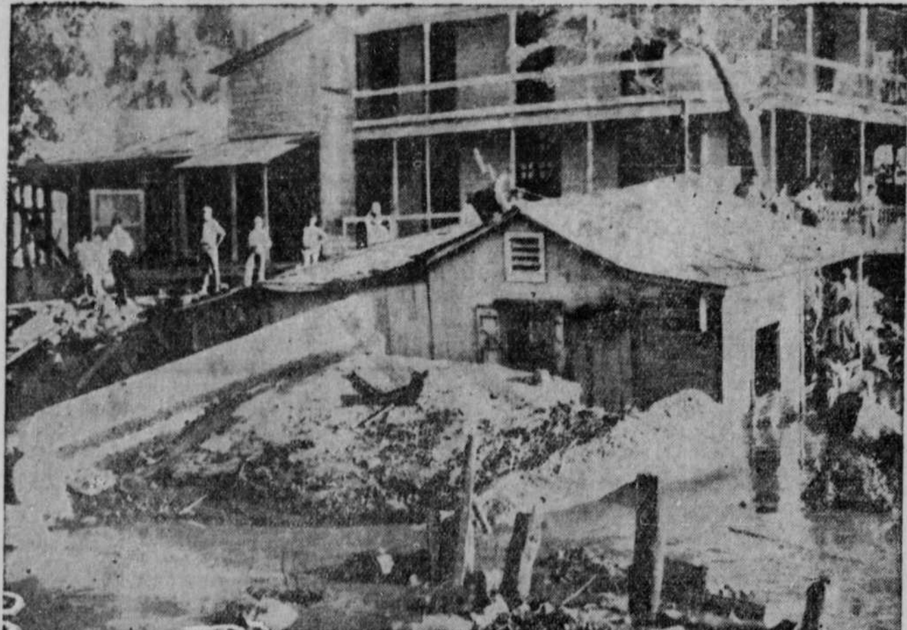
A wall of water from the Yaguez River, which has been swelled to torrential proportions by heavy rains, swept 300 houses to sea at Mayaguez, Puerto Rico, and left this scene of wreckage and death in its wake. Over twenty persons lost their lives, many were injured and $1,000,000 worth of damage was done.