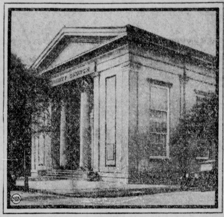
Trinity Methodist church, in Sava nnah, Ga., called "the mother of

TRINITY WAS ERECTED IN 1848. BUT ITS HISTORY DATS BACK TO WESLEY'S VISIT TO TERRITORY MORE THAN CENTURY EARLIER