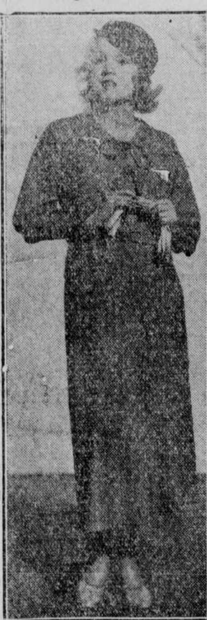
Here is a smart little sports dress, worn by Anita Page, M-G-M actress, which may also be worn as a street frock. It is of soft tan wool, beautifully tailored. Two boxes on the bodice and a soft belt of the same material as the dress are the only ornaments.