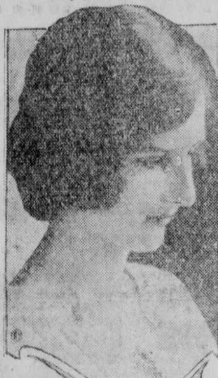
Queen Joanna, wife of King Boris III of Bulgaria, who recently presented her husband and country with a baby princess. The Queen is a daughter of the King and Queen of Italy. This is the first child born to the Bulgarian rulers and the occasion was marked by nation-wide rejoicing when the good news was flashed from Sofia, the capital.