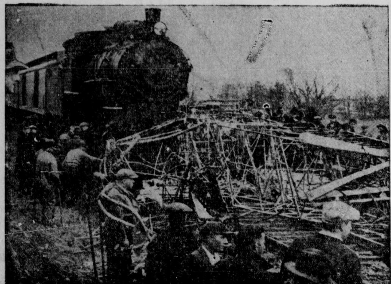
Believe it or not the four occupants of the plane, the taking off from Yorkville, Ohio. But in its dive, the wreckage of which is shown here, escaped without a plane tore into telegraph lines which diminished force scratch. The mammoth army bomber crashed on of the crash and enabled the four Army men to escape the Wheeling and Lake Eric railroad tracks after