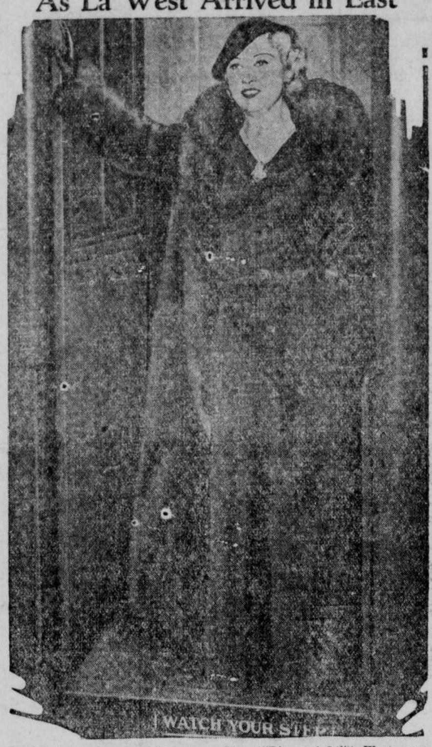
Guided by the lights of Broadway, Mae ("Diamond Lil") West, most recent of the White Way stars to crash the Hollywood firmament, is shown as she returned to New York from the West Coast. La West smiles the same old smile, showing that she has not yet "gone Hollywood."