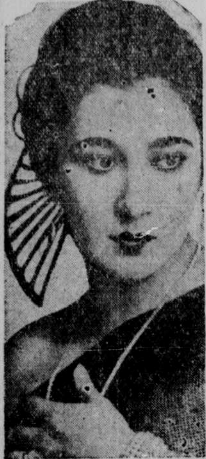
Nita Naldi, former movie actress, who appeared with the late film idol, Rudolph Valentino, in some of his greatest pictures, has been hit by the depression. Recently Miss Naldi filed a petition in bankruptcy in the United States District Court, New York. She declared she had no assets except wearing apparel and some personal jewelry.