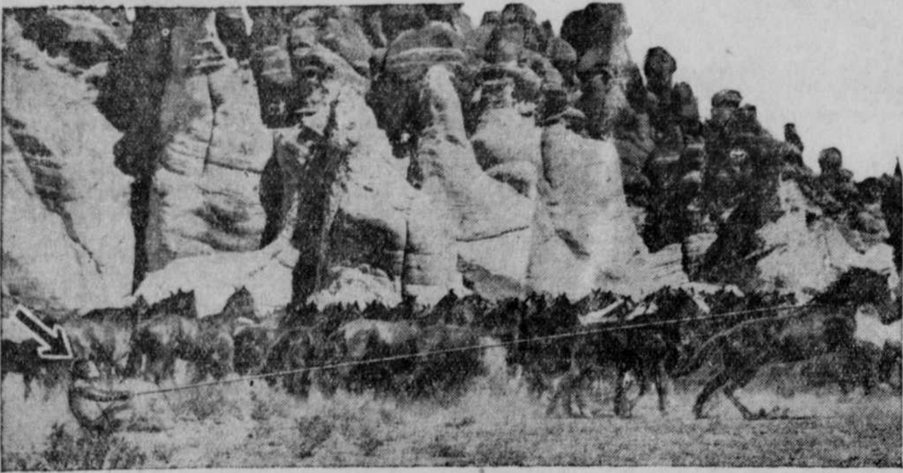
Here is one way of acquiring a mount—if you don't mind being dragged over rocks and cactus at twenty miles an hour. The Navajo Indian (shown by arrow in a cloud of dust) had just lassoed a range pony at Phoenix, Ariz., when this picture was made. The art is not in roping the horse, but in "cutting," or separating, it from the rest of the herd without being trampled.