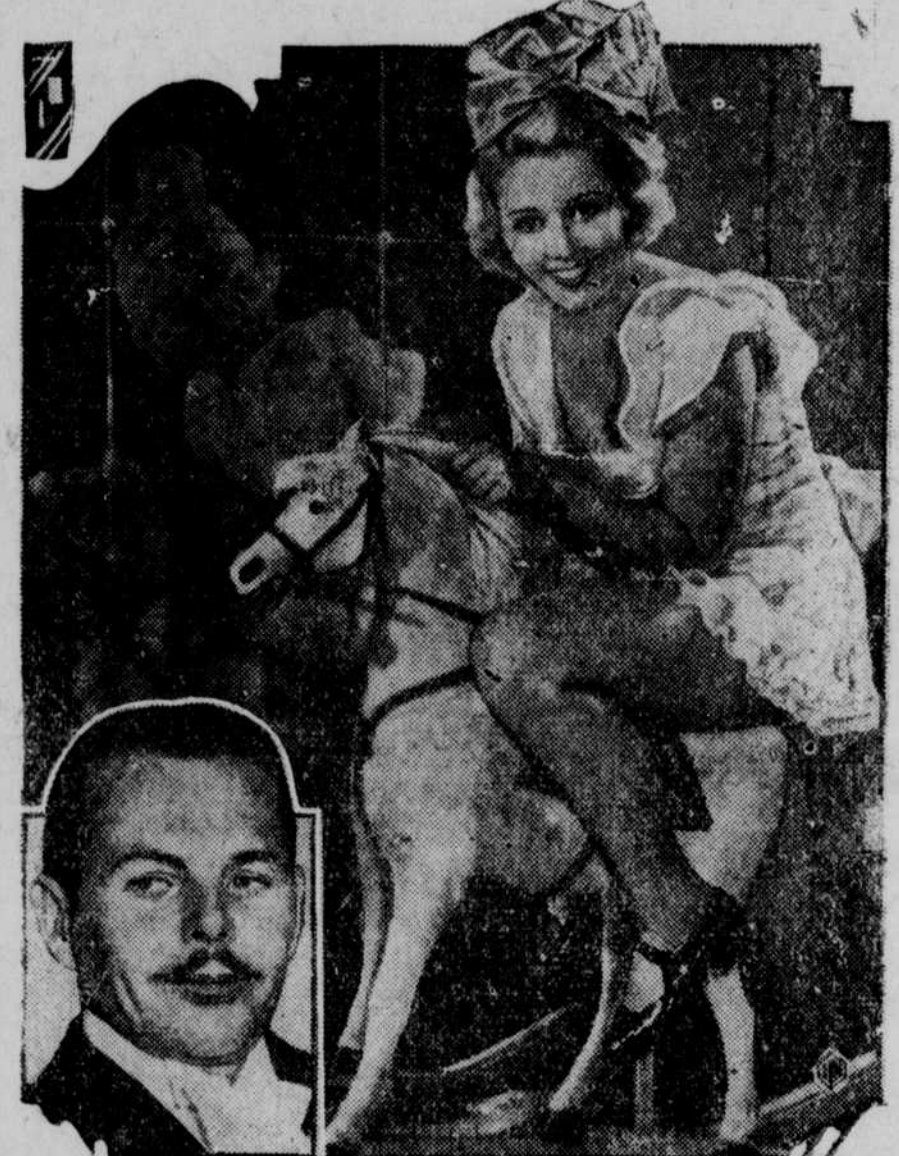
Lovely Joan Blondell, screen star, might have been entered in the matrimonial sweepstakes when this picture was made recently. Whether she was or not, Joan is now a bride, having taken her cameraman sweetheart, George Barnes (inset), for better or worse in a secret wedding at Phoenix, Ariz. Joan concealed her lovely blonde tresses under a red wig to avoid publicity.