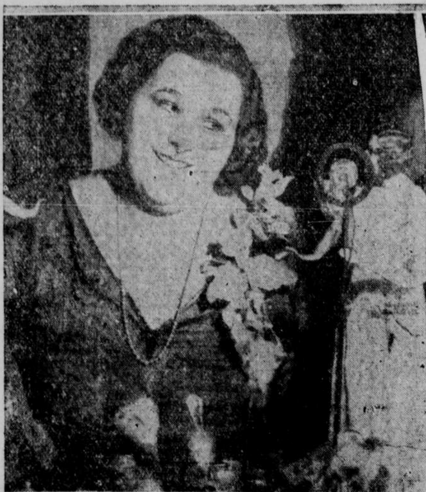
From the pleased expression on the face of Kate Smith, radio and screen star, one might almost imagine that the long-delayed moon has come over the mountains at last. But it isn't so, the famous ether warbler is just tickled at the wonderful party given in her honor by a great galaxy of screen stars at Hollywood recently. Note the little dummy figure at the microphone. This was one of the table decorations.