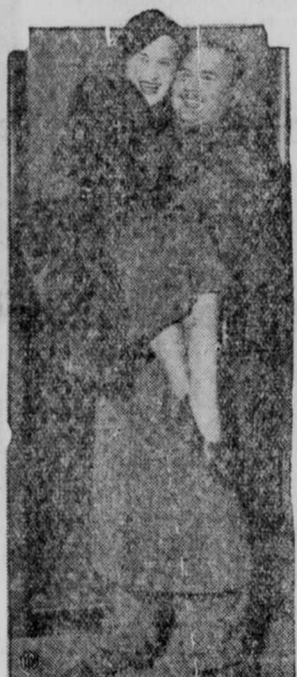
"You've Got Me in the Palm of Your Hand," might be the theme song for this picture, showing Paul Whiteman, King of Jazz, as he playfully assists his wife, the former Margaret Livingston from the train on their arrival at New York from the Coast. If you think Paul has reduced his tonnage, all the credit goes to wife, who keeps him on a diet.