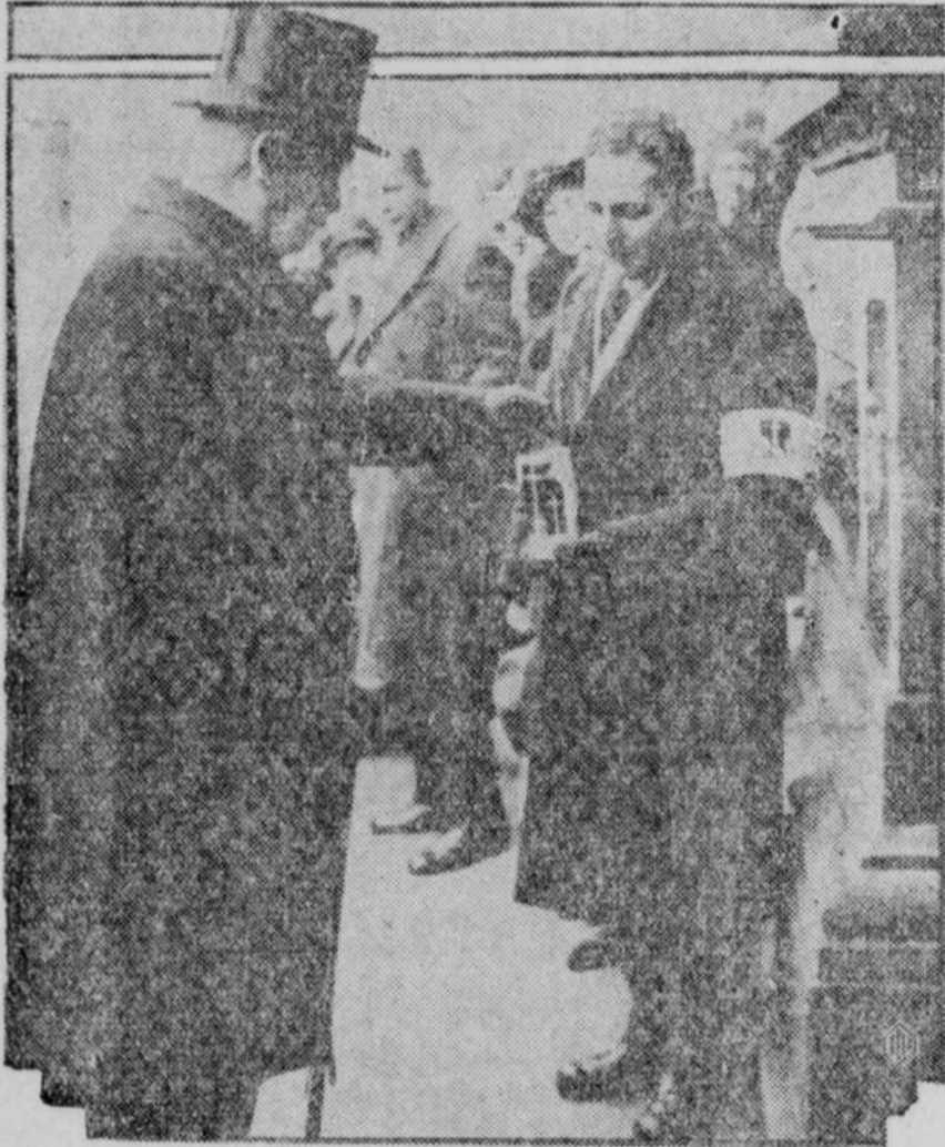
Notwithstanding the unsettled political situation of his country and the added burden it places on his shoulders, President Paul Von Hindenburg, of Germany, still finds time to remember his war-time comrades. Here the 85-year-old soldier-statesman is shown as he paused to make a contribution to the fund for the upkeep of the graves of Germany's war dead as he entered the Garrison Church in Berlin for services.