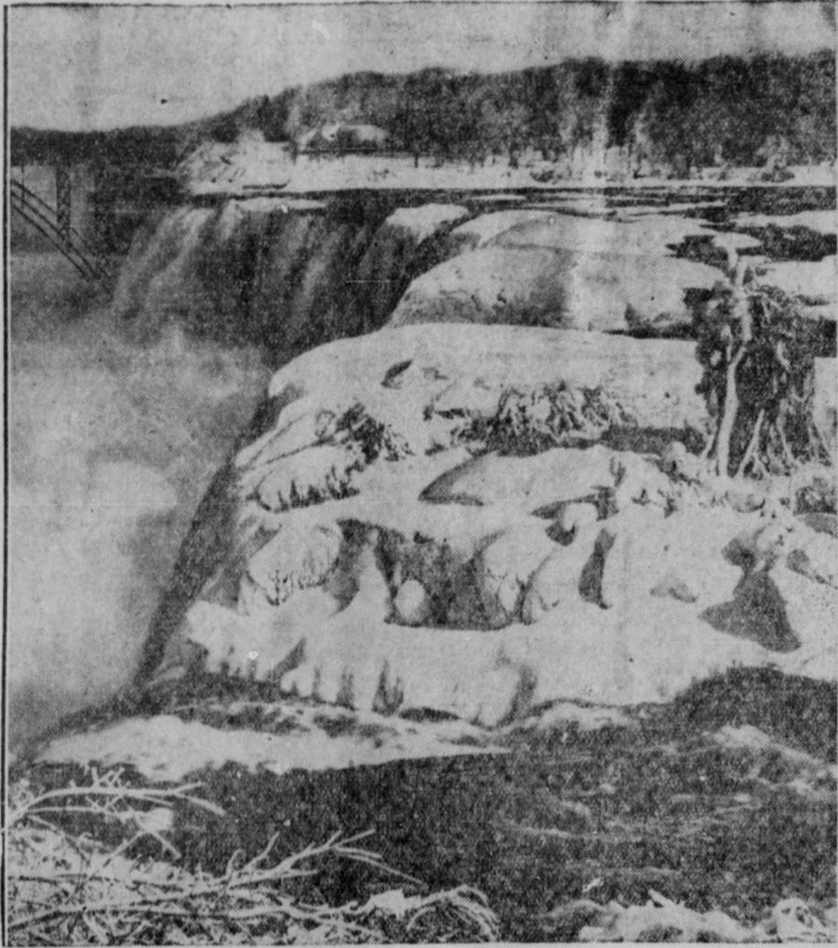
No matter where you see it, it's Winter just the same. Above, the season's first snowfall adds a striking touch of glistening beauty and muffling the roar of the thundering cataract. Old King Winter is still the daddy of all artists.