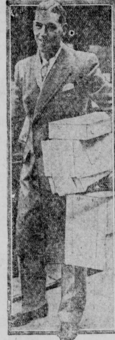
Henry Cardozo, nephew of Justice Benjamin Cardozo, of the United States Supreme Court, is shown at his job as a driver for a Chicago laundry. The boy is studying law at night with the determination to follow in the footsteps of his distinguished uncle.