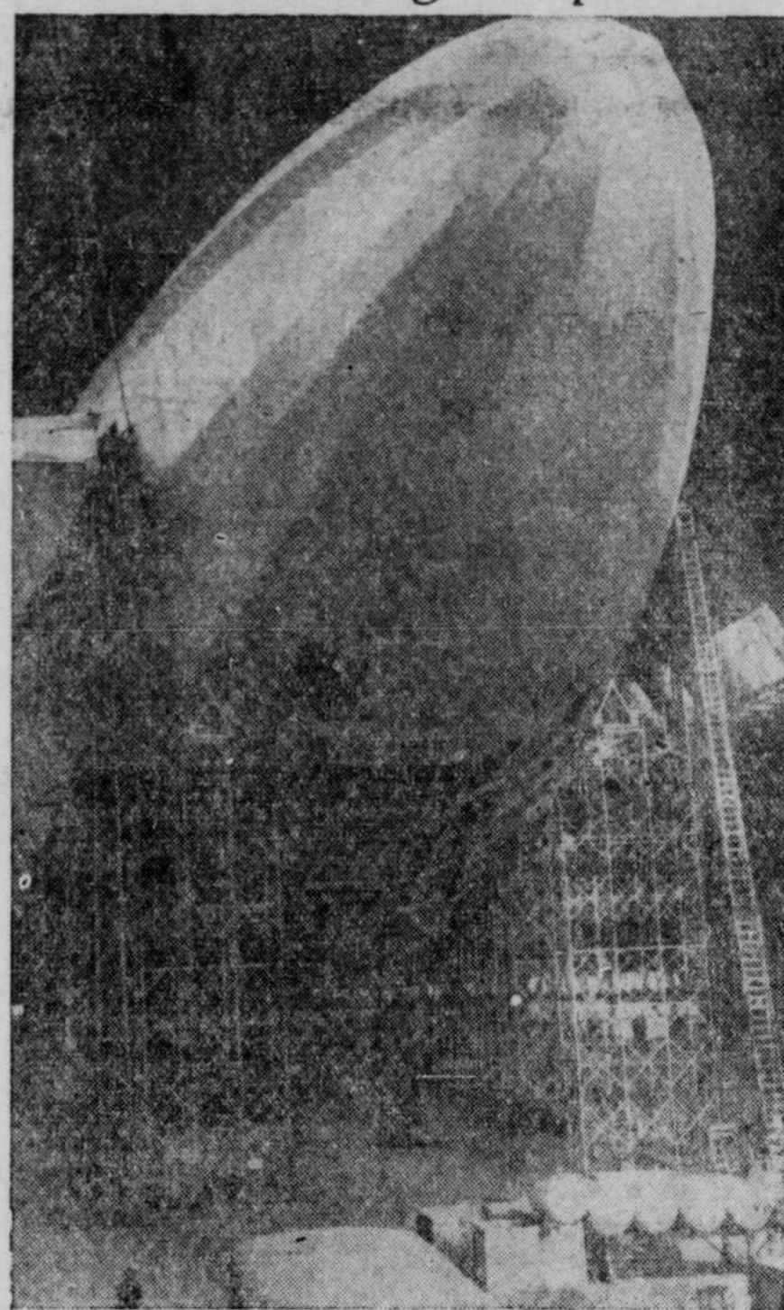
The newest air leviathan-to-be, the dirigible Macon, is shown as it nears completion in the giant construction hangar at Akron, O. It is a sister ship of the United States airship Akron. When the Macon takes the air about five months from now, the Navy will possess the two largest and most modern airships in the world.