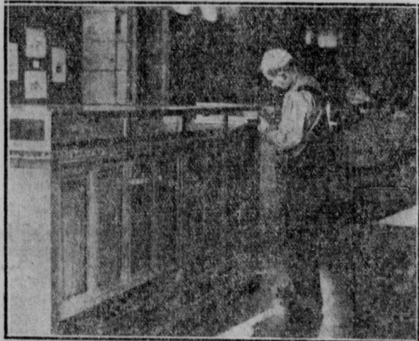
Yes, it looks like a perfect illustration of the old maxim about locking the stable door. A locksmith is shown changing the lock on the manuscript case at Columbia University, from which thieves purloined the original manuscript of Sir Walter Scott's "Guy Mannering." The treasure was one of the prized possessions of J. Pierpont Morgan.