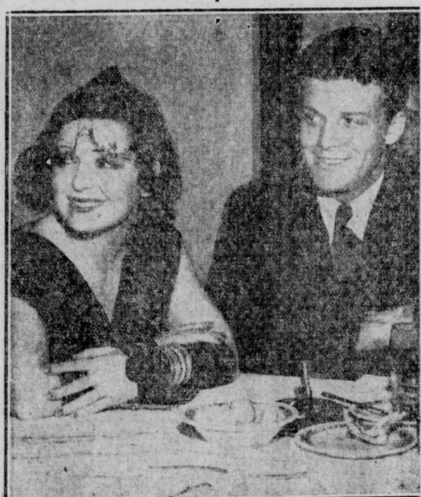
Clara Bow, famous as the "It" girl of the screen, seems to be her old self again as she is pictured dining with her husband, Rex Bell, also of the movies, at a popular Hollywood rendezvous. Miss Bow recently returned to the films after a long absence, following a nervous breakdown.