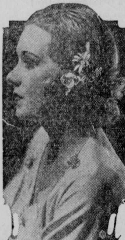
Here is the very latest thing in coiffure, introduced by lovely Anita Page, screen actress, and taken up in a big way by the entire film colony at Hollywood. A fillet of flowers is worn across the back of the hair, ending over each ear. The coloring of the floral decoration is chosen to match the evening gown.