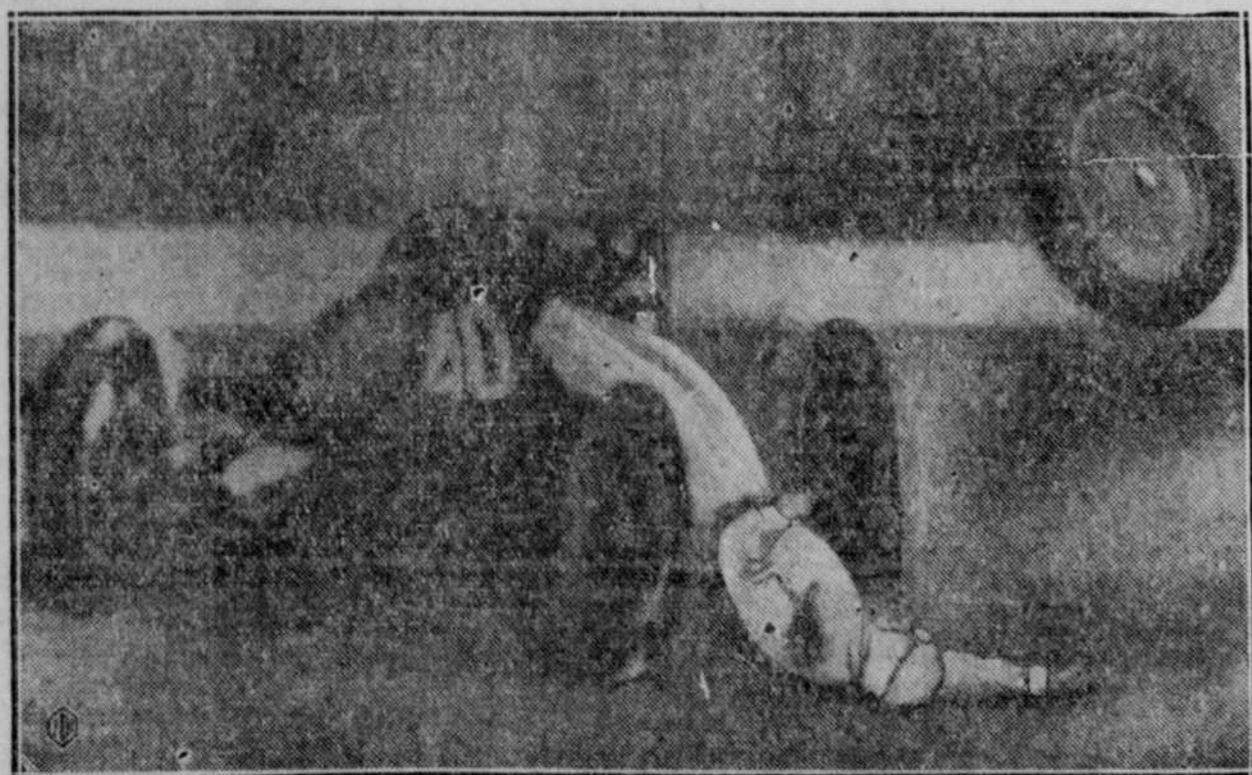
Frank Sues probably wouldn't give a thin dime for his chances, nor would anyone else who witnessed this scene, when this photo was made during an auto race at Los Angeles. The car in which Sues was traveling at terrific speed is shown in the remarkable "shot" as it cast two wheels, throwing the driver out of the cockpit. Sues slid for 50 feet across the track in the path of oncoming cars, but miraculously escaped injury. A few minutes later he was at the pits looking for another car to drive.