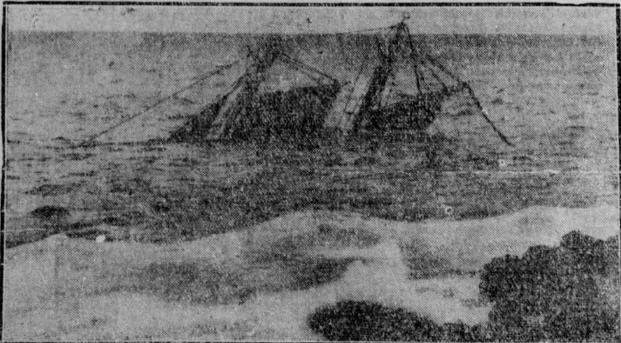
With only her topmasts above the water to mark her grave, the schooner Lochinvar, a 20-year-old veteran of Maine. The captain and his crew of 14 had a narrow escape, but all were saved.