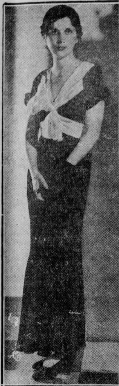
The stilet figure of Dina Wynyard, screen actress, is ideally suited to this lovely new fall model for evening wear. It shows a girde of white angel-skin with matching bow and collar trim, set off by the black velvet of the gown. In calling with the formality of the style, the sleeves end above the elbows.