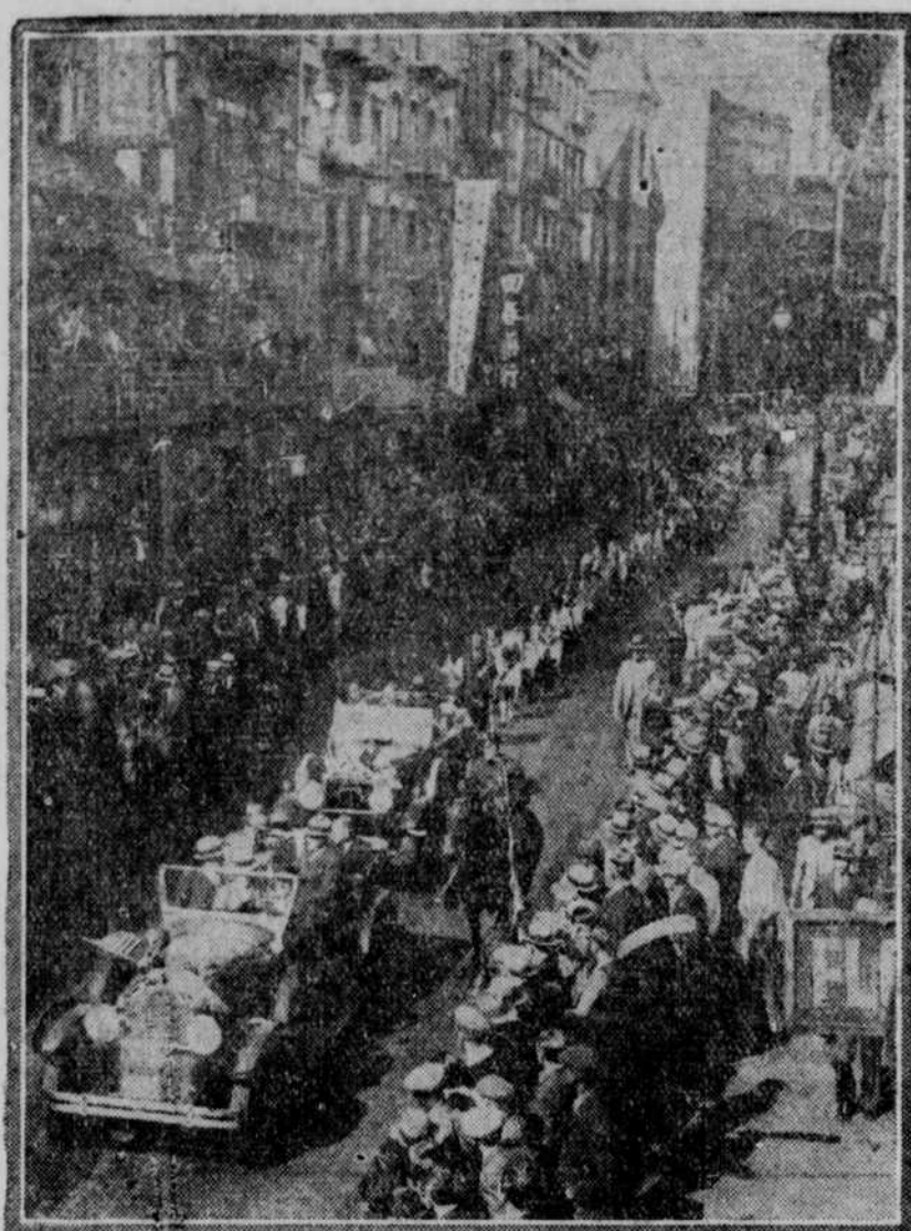
Just like their occidental brothers, the Chinese love a parade and though the event was not observed in their native land, the 20th anniversary of the founding of the Chinese Republic was made the occasion for a celebration in New York. Here is a view of the parade as it wended its way through the maze of Chinatown. The procession visited the City Hall where Mayor Joseph V. McKee and Dr. Sze, Chinese Minister to Washington, made speeches.