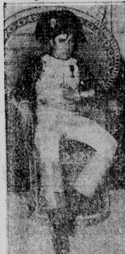
You will hardly recognize this impersonator of Napoleon, so just to save time we'll tell you who he is. Believe it or not it is the one and only Charlie Chaplin, minus the mustache and number 18 shoes. He is said to be considering playing serious roles, among them that of his favorite character, Napoleon.