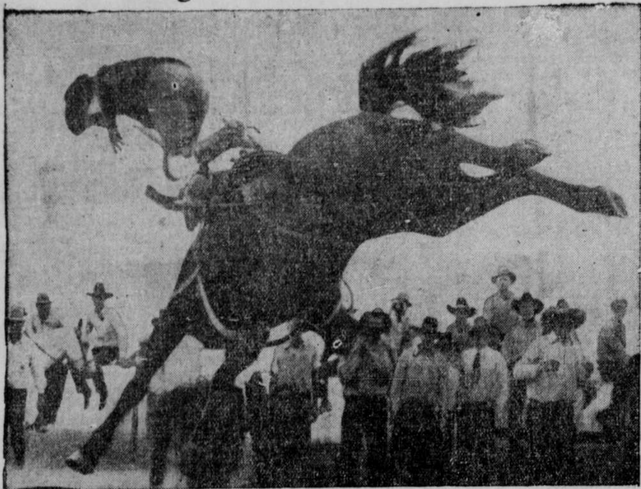
A job we don't want, even if there is a depression, is that of bronco-buster. The above picture is reason enough for anyone who prefers the quiet life to stick to crochet and leave equine dynamite to the chosen few who just adore being shaken up like a cocktail. Up, down, sideways, rocking and pitching, there's no telling what an obstreperous bronc will do. But it's all good fun at the rodeo.