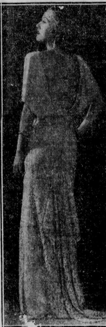
The gorgeous evening gown worn by Evelyn Knapp, screen player, is of pure white lace, fashioned in graceful drapes to follow the flowing lines of the figure. The gown features shoulder sleeves that form a cape effect. Note the semi-train.