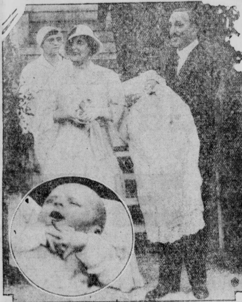
An interesting photo, showing former King Alfonso of Spain holding the baby of Princess Ileana of Rumania, for which the ex-ruler acted as godfather. With Alfonso is Queen Marie of Rumania, mother of Princess Ileana. Photo was made on the occasion of the baby's christening at Vienna, Austria. Princess Ileana is the wife of Arch Duke Anton of Hapsburg. A fine close-up of the baby, who was named Stefan von Hapsburg, is shown in inset.