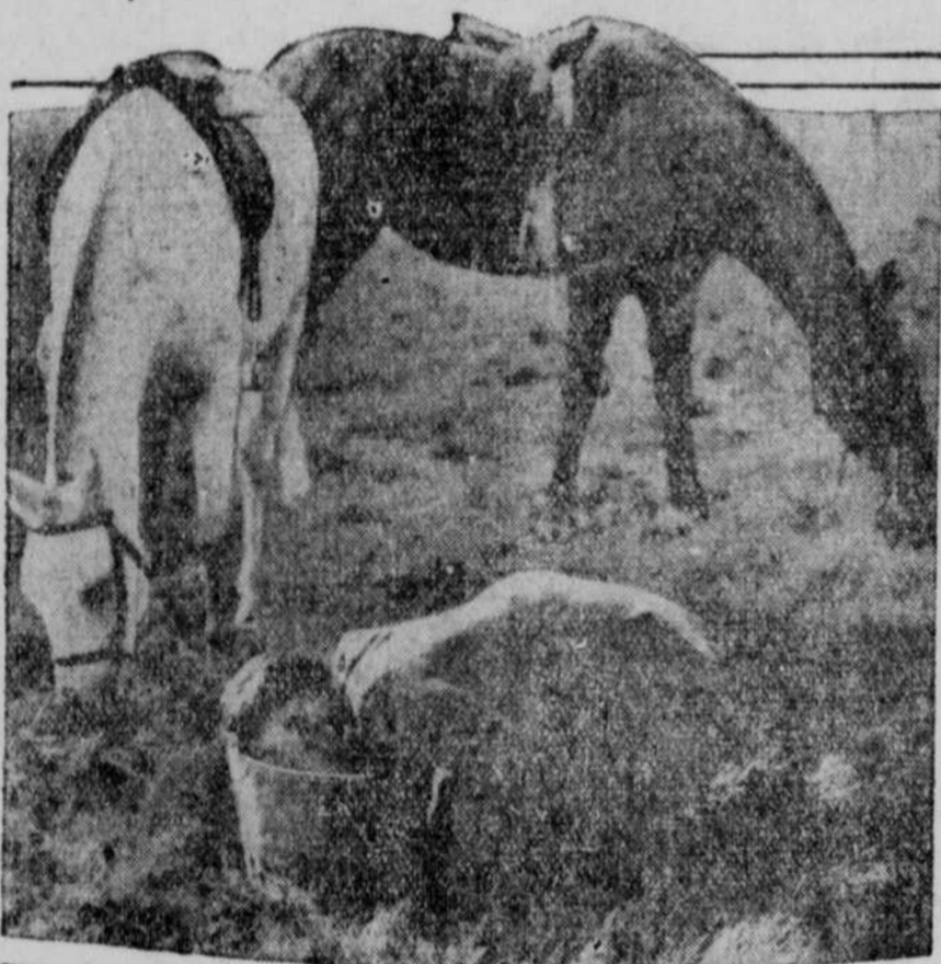
Following in the footsteps of his royal uncle, the Prince of Wales, but not emulating the latter's method of dismounting, young Viscount Lascelles, son of Princess Mary of England, is a keen horseman. Here he is shown with his head in a water pail bobbing for the apple after racing on horseback to the finish line during a recent gymkhana at Harewood, England.