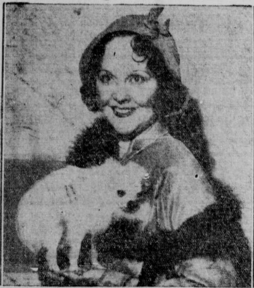
Returning from a vacation abroad with her husband, Jules Brulatour, film magnate, Miss Hope Hampton, famous stage star, is shown as she arrived at New York on the S. S. Leviathan. She is holding her 17-ounce Pomeranian, "Ponzey," said to be the smallest of his breed in the world.