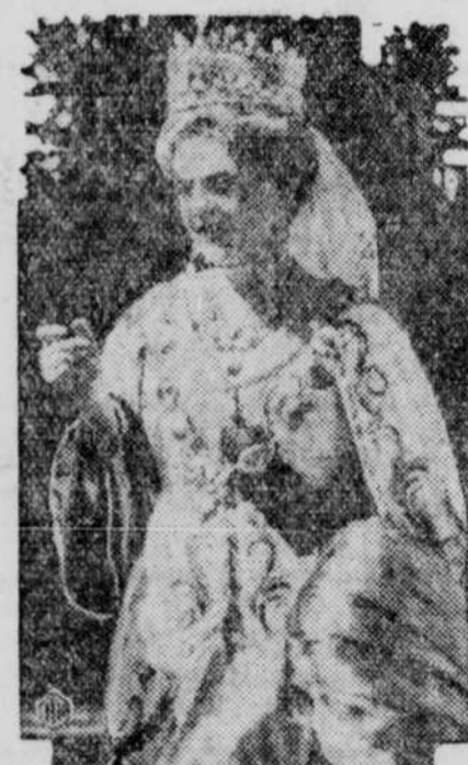
Attired as befits royalty, Ethel Barrymore, famous member of the stage and screen "royal family," is shown as she appeared on the set during the making of the new film "Rasputin," in which she enacts the role of the Czarina. Her brothers, Lionel and John also play leading parts.