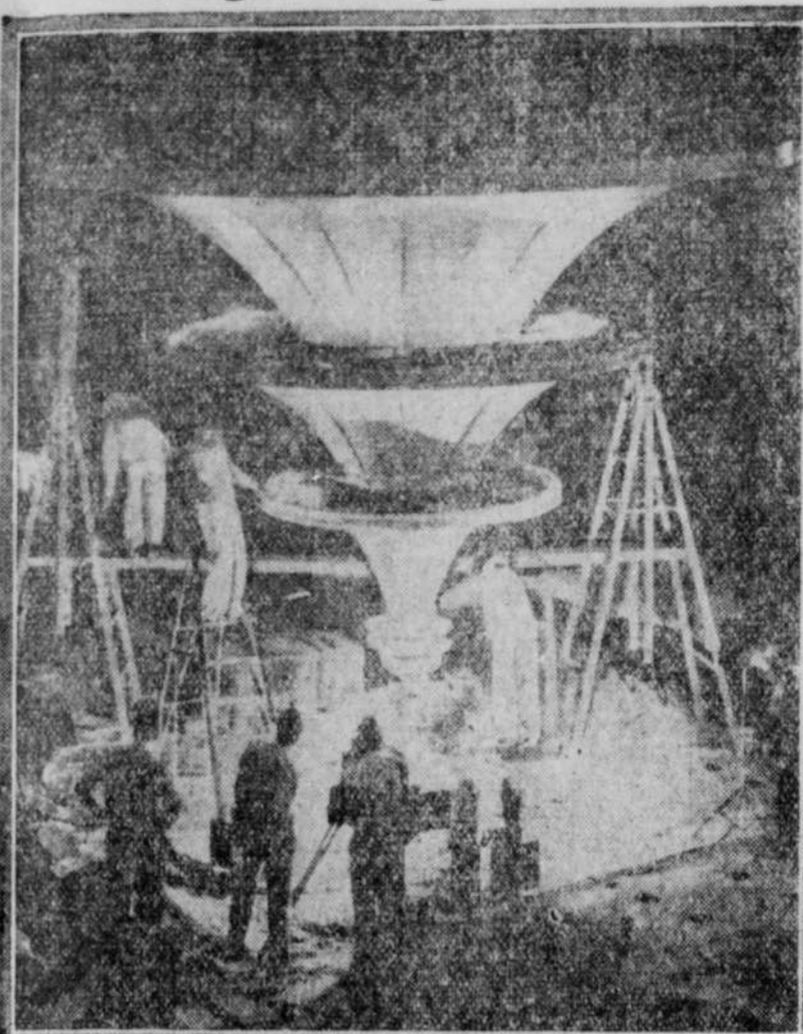
Weighing 6½ tons and measuring 25 feet in diameter, this giant chandelier, said to be the largest in the world, is being made ready for installation in the International Music Hall of Rockefeller City. An idea of the size of the big lamp may be gauged by comparison with that of the men working on it.