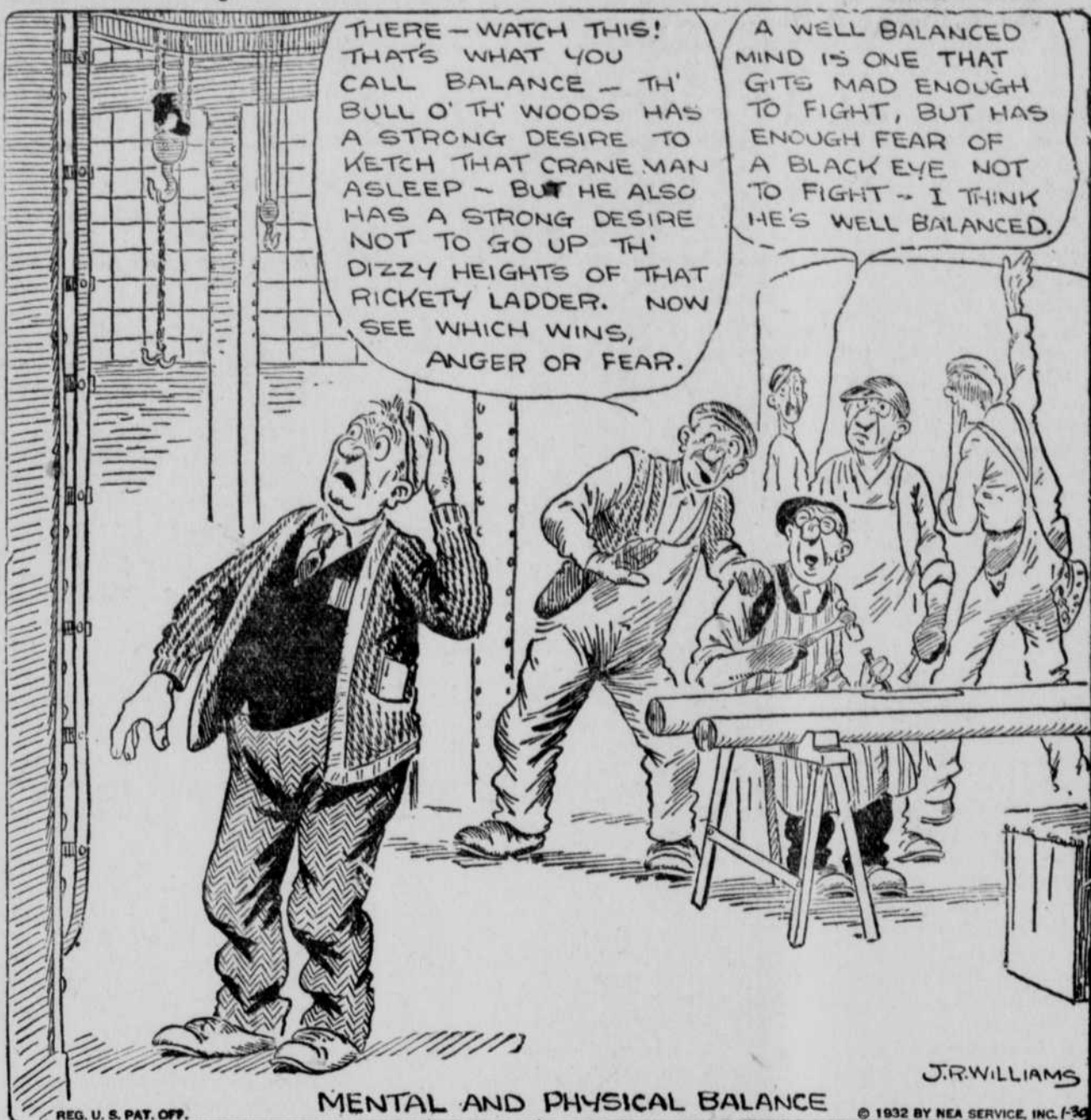
MENTAL AND PHYSICAL BALANCE