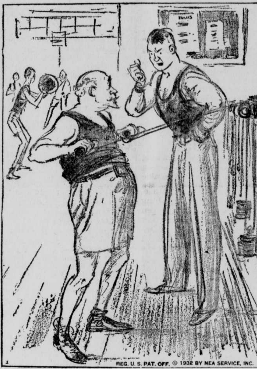
And there's no use trying to cheat, judge. I'll be over here watching ya.