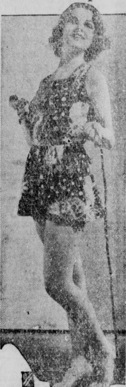
The latest for Summer resort wear is the short romper suit. Made of printed, striped or dotted material, these rompers are particularly adapted for occasions when active sports are on the calendar. Lillian Bond, screen player, shows a model with gay red polka-dots and flowers scattered on a ground of black. Note the waist-line bodice and flaring skirt with short length.