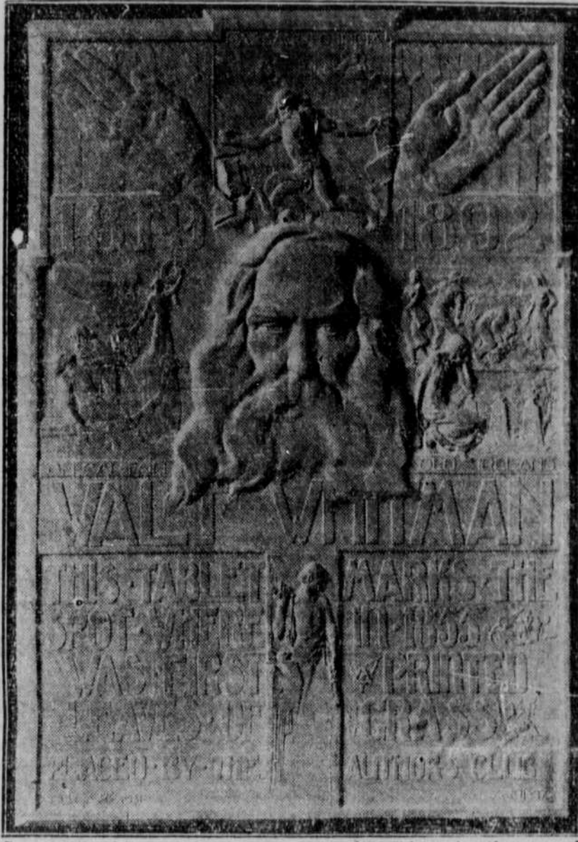
Commemorating the first issue of Walt Whitman's "Leaves of Grass," the Authors' Club of New York recently unveiled the bronze tablet shown above at the spot in Brooklyn where the Rome Brothers' little printing shop set up the first edition of the noted author's work. Whitman himself toiled at the compositor's case, slowly setting type for a book that was long unappreciated. Now original copies of the first edition bring about $5,000.