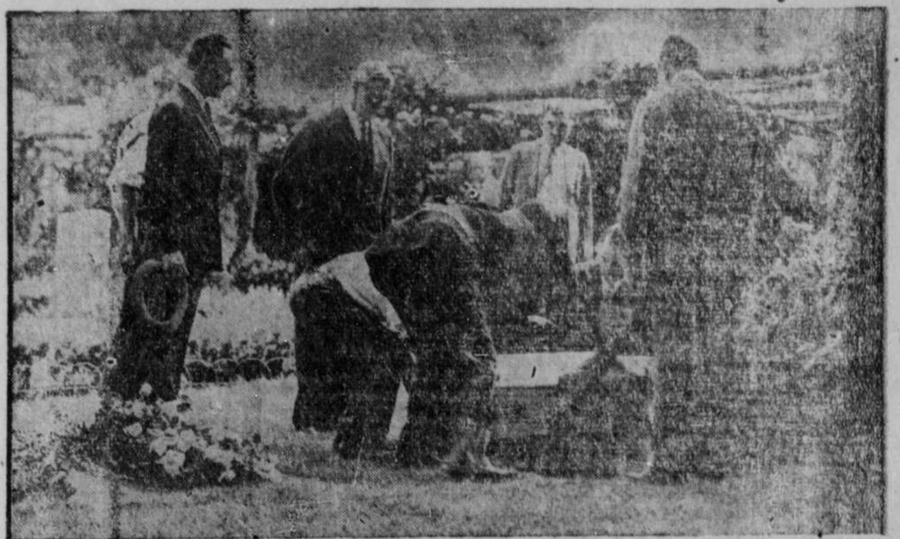
Genuine human sorrow accompanied Igloo, peppy little fox terrier in his day, to his grave in Pine Ridge Cemetery, Dedham, Mass. Rear-Admiral Richard E. Byrd, with whom Igloo shared the perils of the South Pole, is shown standing at left with head bared as his pet dog and companion is lowered into the earth. Igloo accompanied the Admiral on his lecture tour following the Antarctic expedition until indigestion killed him.