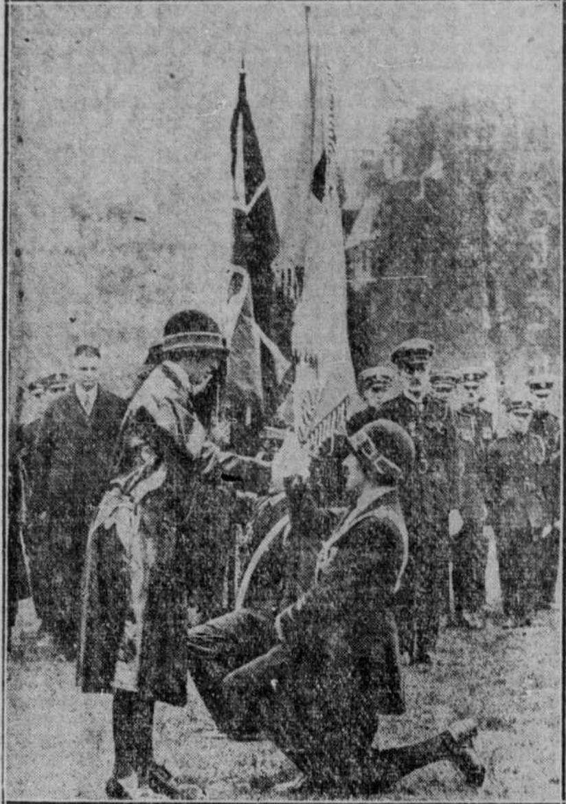
H. R. H. Princess Mary, of Great Britain, is shown presenting the colors to the British Red Cross Society in an impressive ceremony at the Duke of York's headquarters in London. An especially appointed guardian is shown kneeling to receive the stand. Leaders of the Red Cross movement throughout England took part in the ceremony.