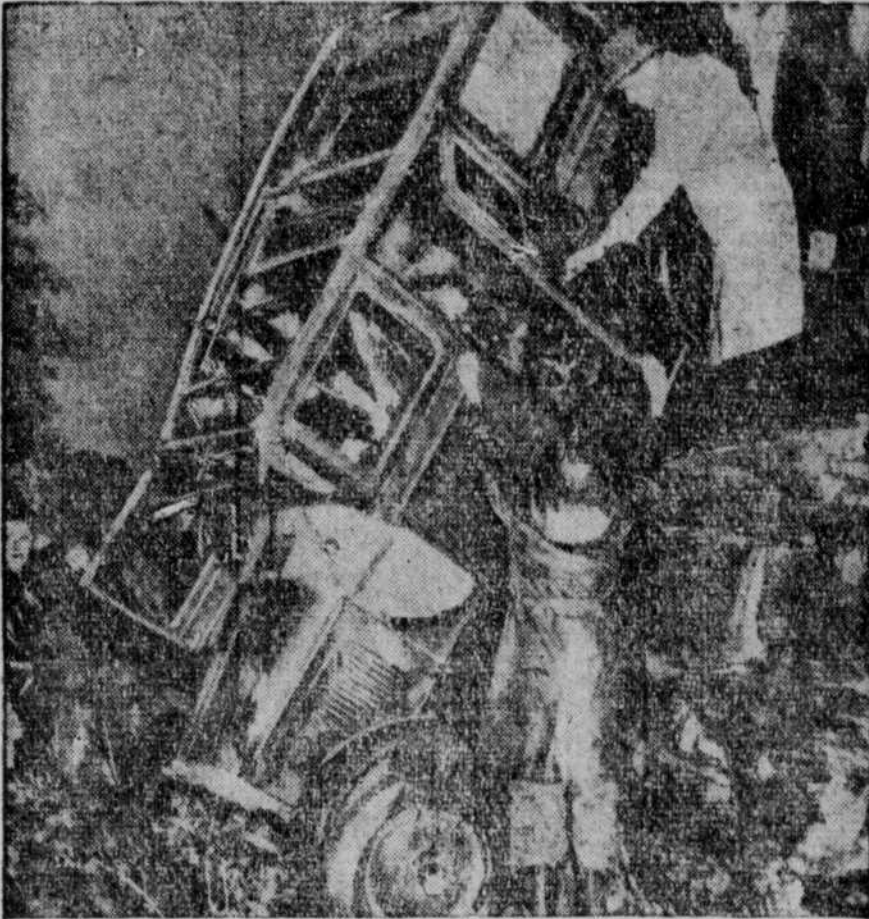
Maybe it was a leap for honor to clear its name that induced this once respectable Boston automobile to drive off the road after it had been appropriated by several amateur auto thieves. At any rate, the thieves soon discovered they couldn't drive the car successfully, as this picture proves. All hands leaped to safety, however, before the crash and escaped capture. Like to sell the luckless owner a new car?