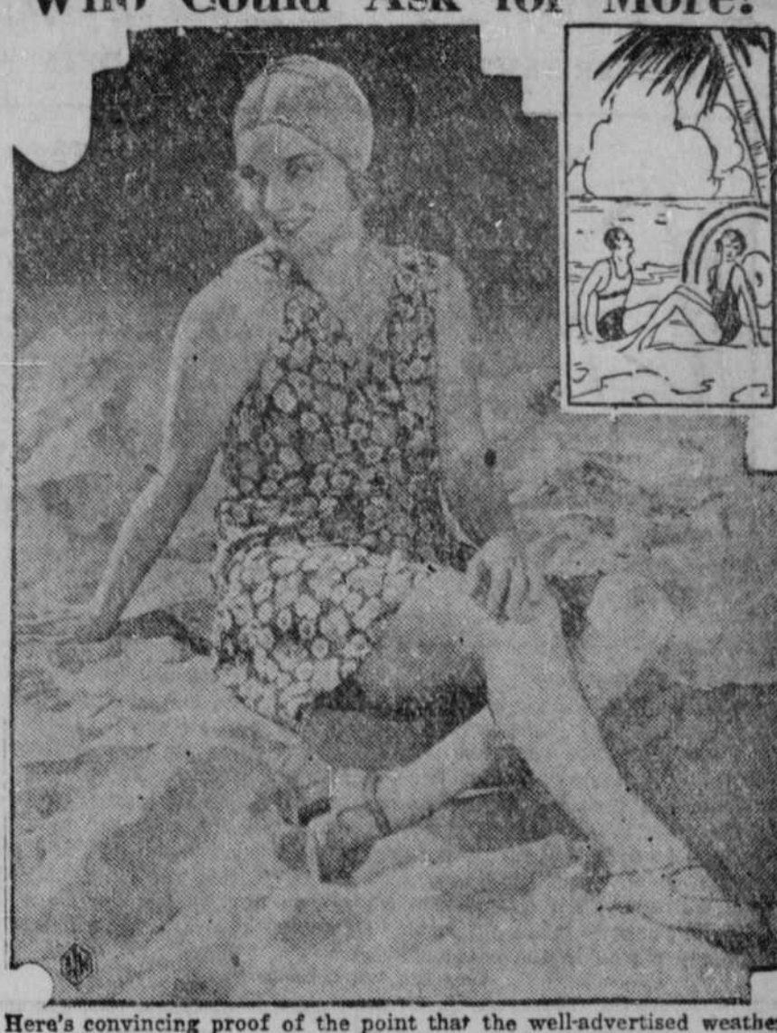
Here's convincing proof of the point that the well-advertised weather is not the only asset in California. One night even be pardoned for saying that the beautiful maiden so alluringly draped by the seashore should be what every fully equipped beach needs to ensure lasting popularity. What the wild waves must be whispering to lovely Leila Hyams, M-G-M movie actress, can't be far removed from "Let's get together." You can't blame them, can you?