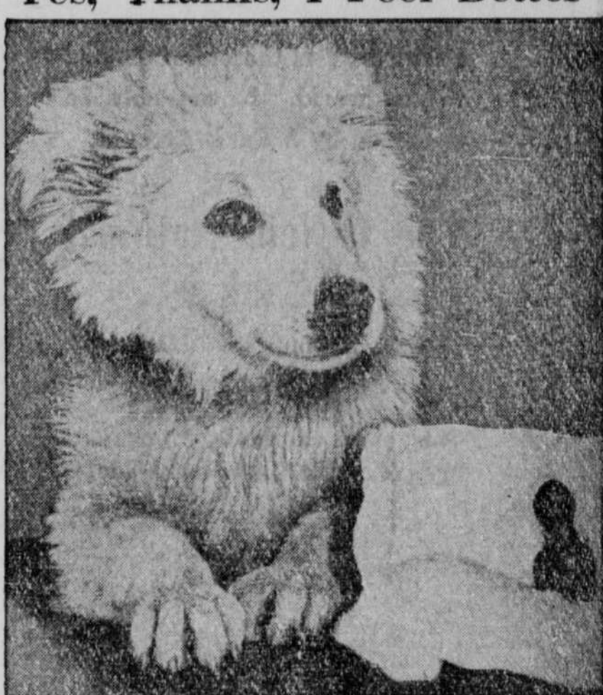
May we introduce to you one winsome pup who answers to the mou-icker of Sparky? Having just been given such a dose of medical science that the surgeons were literally up to their ears in microbes recovering a baby's rubber nipple which Sparky inopportunely swal-lowed, the fluffy-haired pup is now ready to take a new lease on life. But he's certain of one thing—he isn't going to steal any more mile from babies. It doesn't pay.