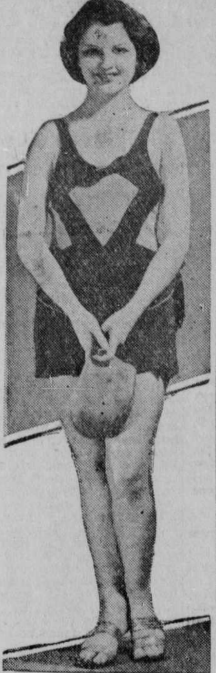
Charmingly displayed by Lillian Bond, screen star, this modernistic patterned bathing suit is carried out in harmonious color combinations. The blending of light and dark green in the above model gives a pleasing effect.