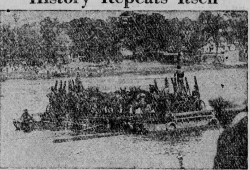
Washington's historic crossing of the Delaware was re-enacted, as shown above, by American soldiers the other day, but instead of the frail boats which the first President and his men had to use, and without the additional hazard of drifting ice, the twentieth century doughboys laid and relaid pontoon bridges to test their strength. This picture shows a pontoon load of men, machine guns, horses and mules crossing the Delaware. If only Washington could have seen it—and marveled.