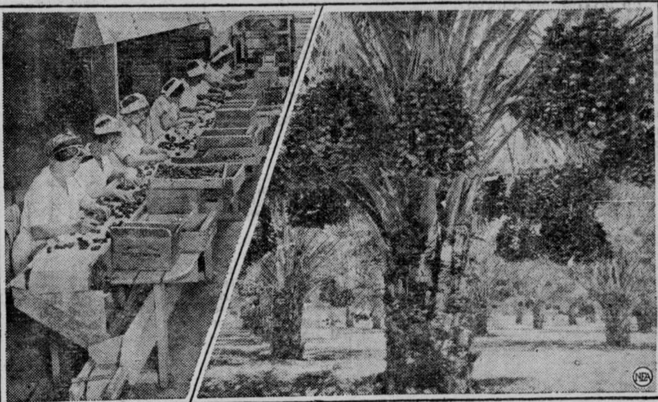
Girls packing dates as the fruit passes on an endless belt, is shown at the left. At the right is shown a date tree with typical clusters of the fruit.