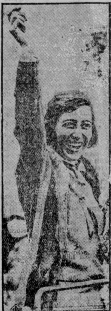
Miss Amy Johnson, 19-year-old British aviatrix, beside herself with joy after her landing at Brisbane, Australia, recently, at the end of her long solo flight from England to the Antipodes. The flight required nineteen days, ending on May 24. She is shown with a bouquet presented to her by an admirer.