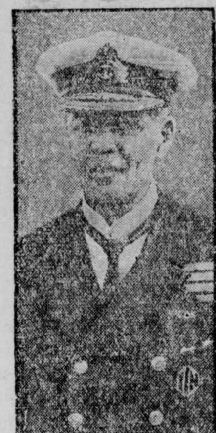
A new portrait of Admiral Sir Frederick Field, new First Sea Lord of England, who is to succeed Admiral Sir Charles Madden as the First Sea Lord and Chief of Naval Staff of the Admiralty.