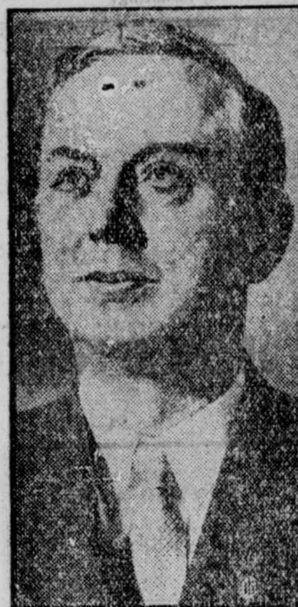
State Treasurer Edward Martin has been re-elected to the chairmanship of the Republican party in Pennsylvania by a wide majority. The forces of Gifford Pinchot, Republican nominee for the Governorship, were routed even in the latter's home county of Pike.