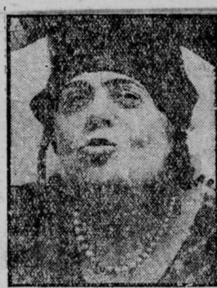
Marie Dressler, famous cinema comedienne, blowing a kiss to the gentlemen of the press as she returns on the S. S. Majestic from a visit abroad.