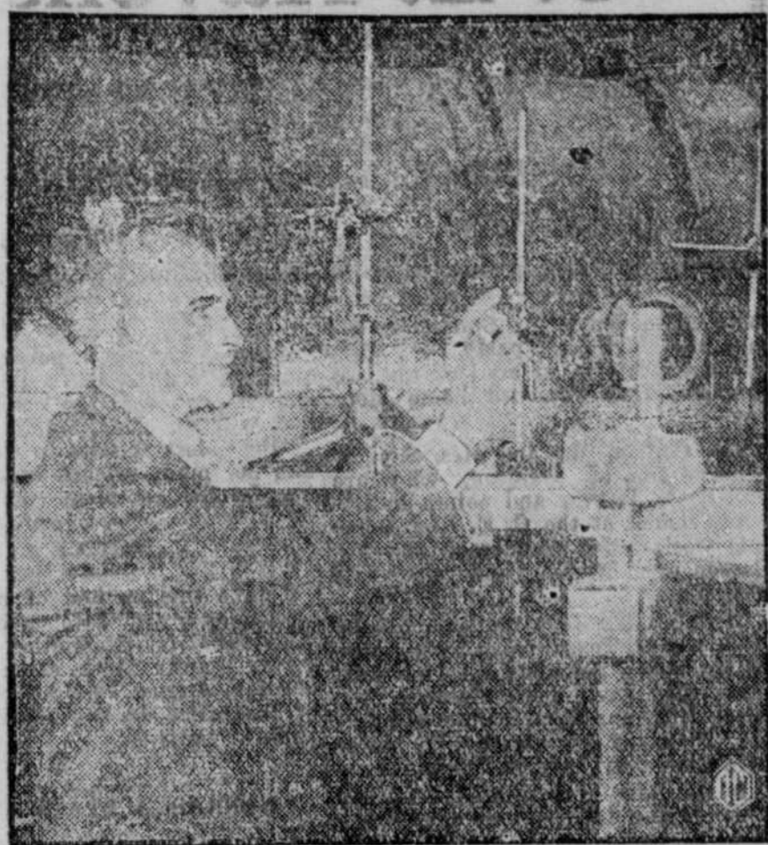
The famous physicist, Dr. A. A. Michelson, testing and approving the mile long test tube — the longest in the world — at Santa Ana, Cal. The tube was devised

to make the first accurate measurements of the velocity of light and is sealed by pipe line below the Californian town.