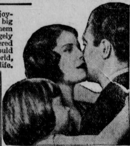
They have found the way to Buoyant, Zestful Health, and the Joy that goes with it

JUST suppose you could get 5000 joyously happy people together in one big hall and could ask them what made them all so full of pep. Suppose, strangely enough, that all of them had discovered the same way to be happy. You would feel that here, if anywhere in the world, was the secret of how to get joy out of life.